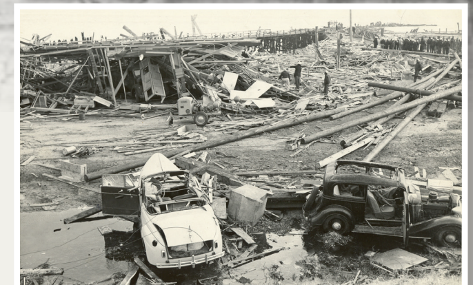
The explosion at Port Chicago Naval Magazine caused widespread destruction.

Today the Port Chicago Naval Magazine tragedy is recognized as a pioneering event in the racial integration of our armed forces, and the sailors' protests helped inspire the civil rights movement of the 1950s and 1960s. Port Chicago Naval Magazine N Mem serves as a reminder of the injustices suffered by African Americans in the armed forces.