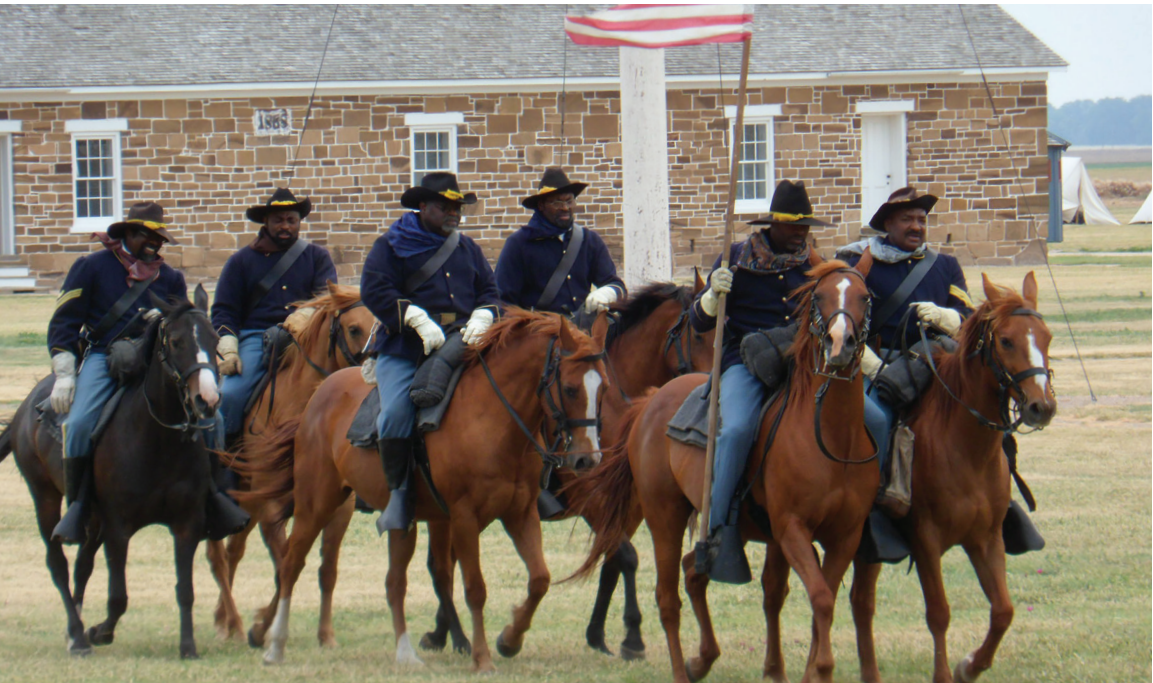
The 10th Cavalry reenactors at Fort Larned National Historic Site in Kansas. See page 13 for more.