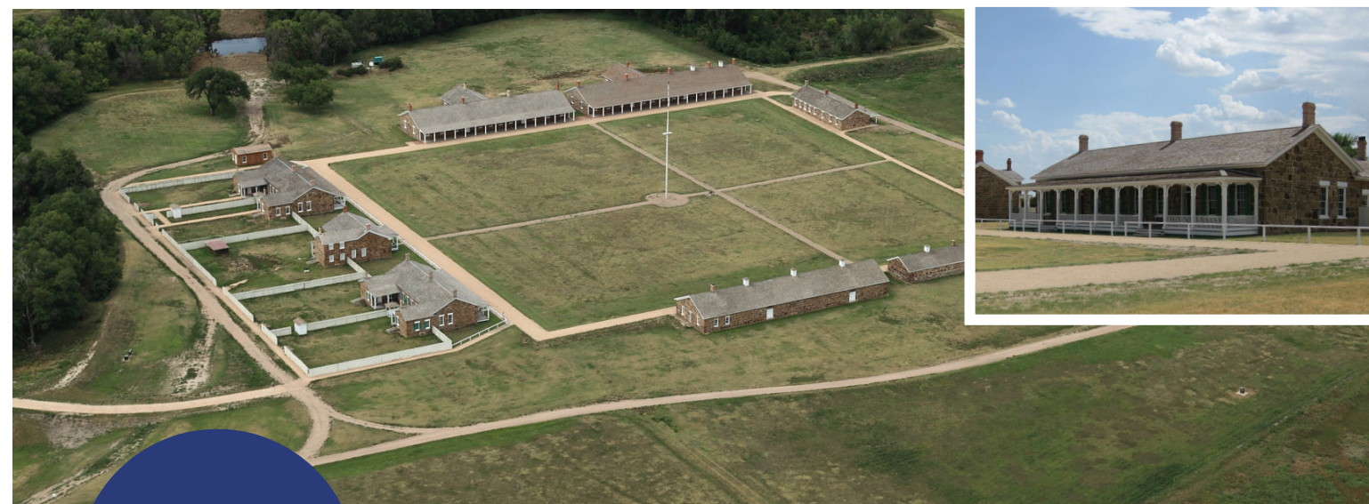
An aerial view and barracks at Fort Larned NHS.