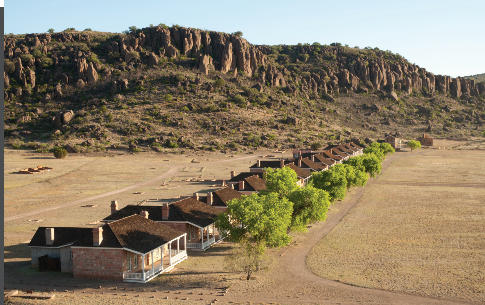
Fort Davis National Historic Site served as regimental headquarters for all four regiments of the Buffalo Soldiers.

February is Black History Month, a month to celebrate “the too-often neglected accomplishments of black Americans in every area of endeavor throughout our history,” as President Gerald Ford said in 1976. Black History Month was recognized across the country that year as part of the United States Bicentennial. Today Black History Month continues to celebrate and honor the accomplishments of black Americans and also recognize important events in black history. Several NPS sites preserve areas and buildings that are sites of importance to black history.