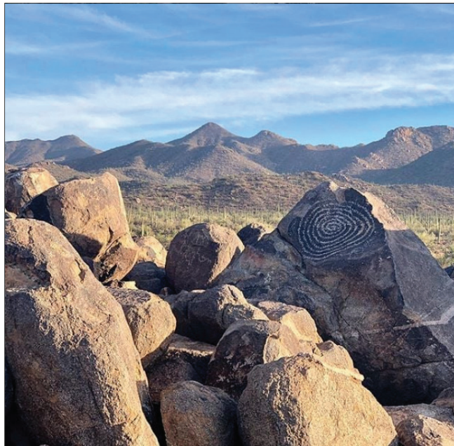
Saguaro National Park.