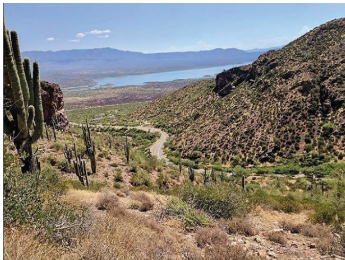
Tonto National Monument.