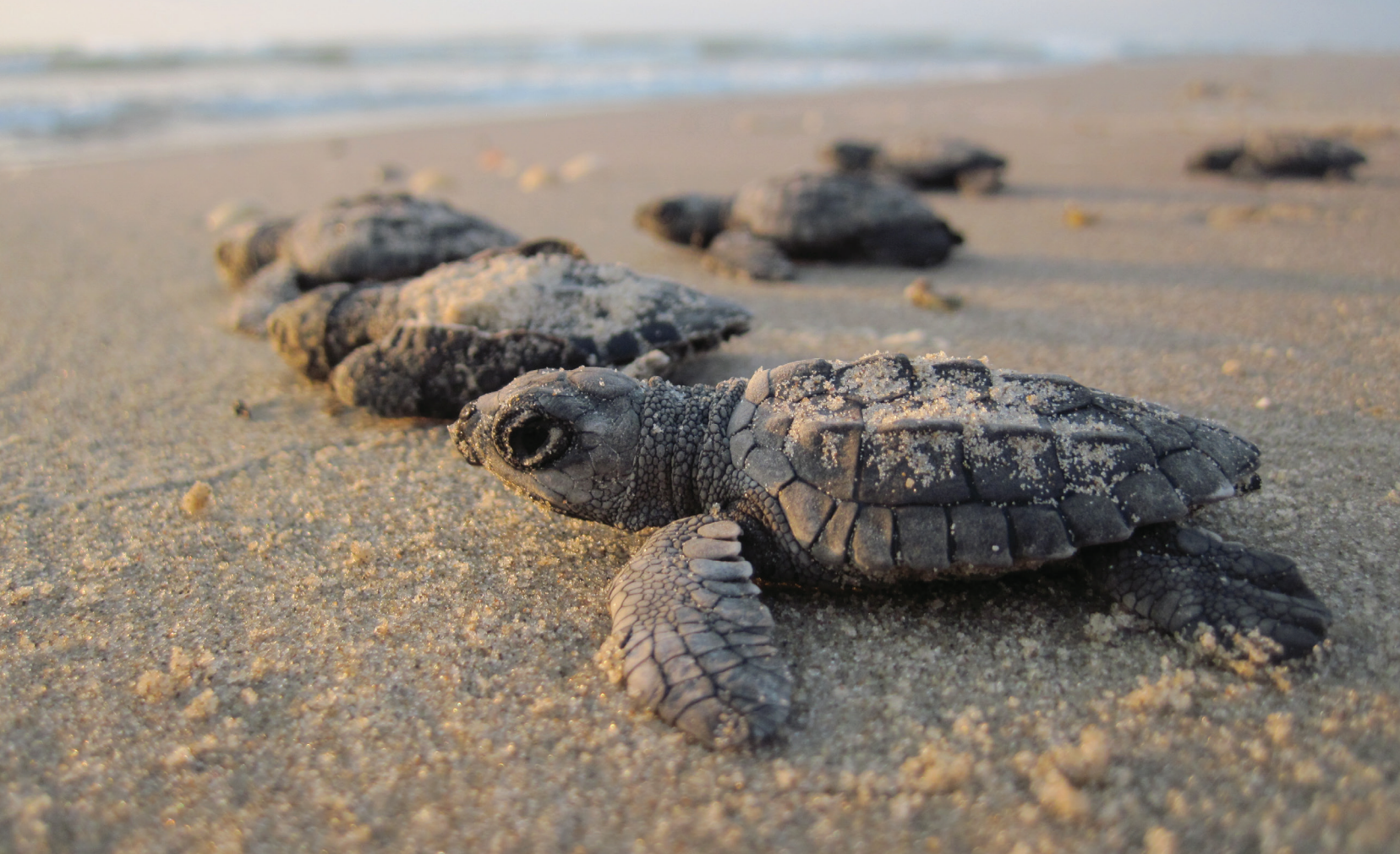
Hatchling releases occur between May and August each year (courtesy of NPS Photo).