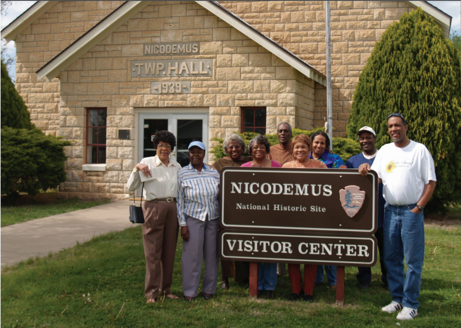
Descendants of Nicodemus settlers visiting the Nicodemus National Historic Site Visitor Center.

of the woods and mountains of their former home, they found only the emptiness of the Great Plains. Some immediately returned home, but over time Nicodemus grew, with four more waves of settlers coming after the initial group. Businesses were established, including a hotel and two stores, and three churches were built. Though life could be hard in the small town, residents of Nicodemus persisted. It was the promise of freedom that propelled them forward. Today, the site is preserved to honor the strength of character and determined perseverance of its settlers.