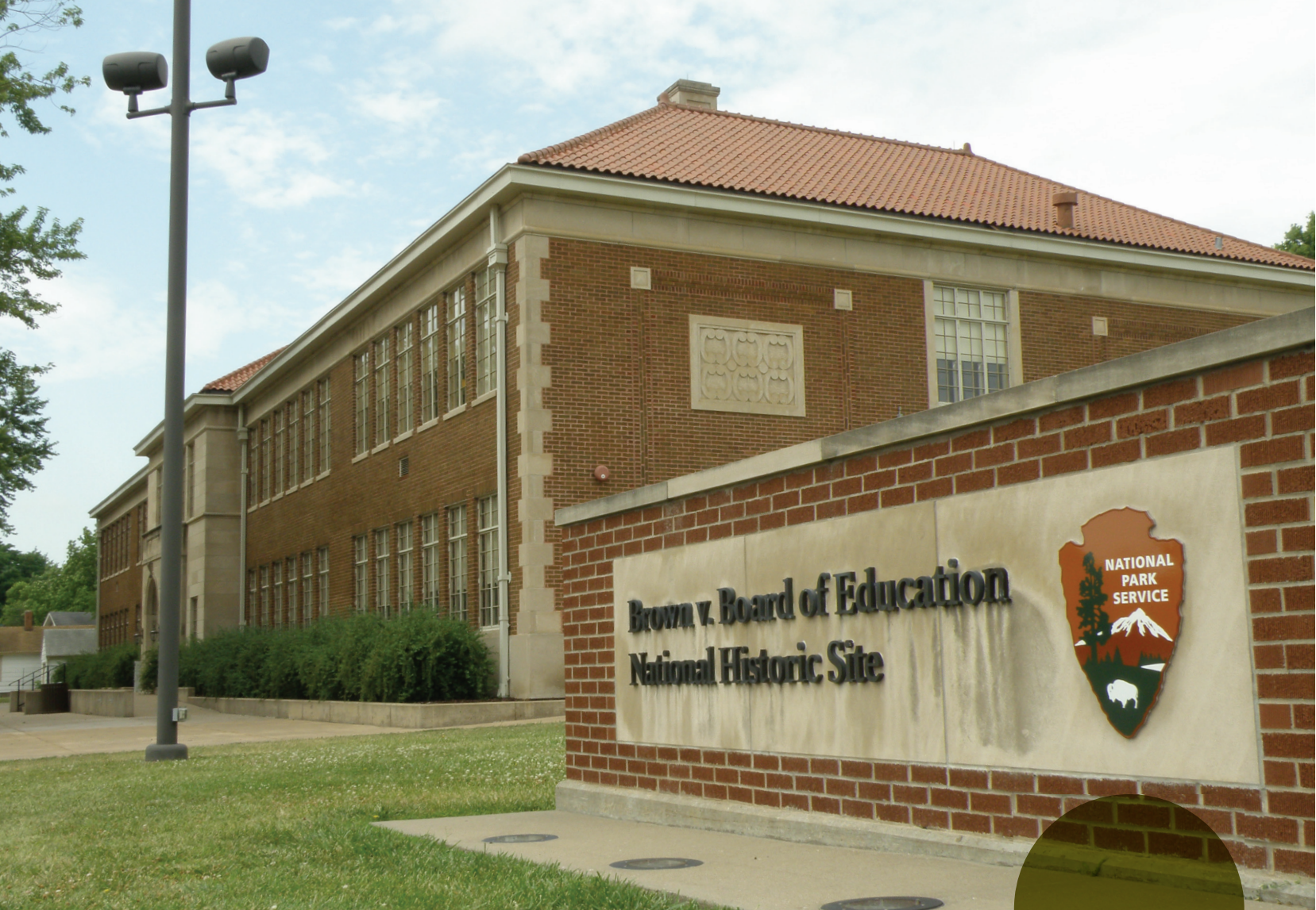
The Brown v. Board of Education National Historic Site commemorates the landmark Supreme Court case of the same name.