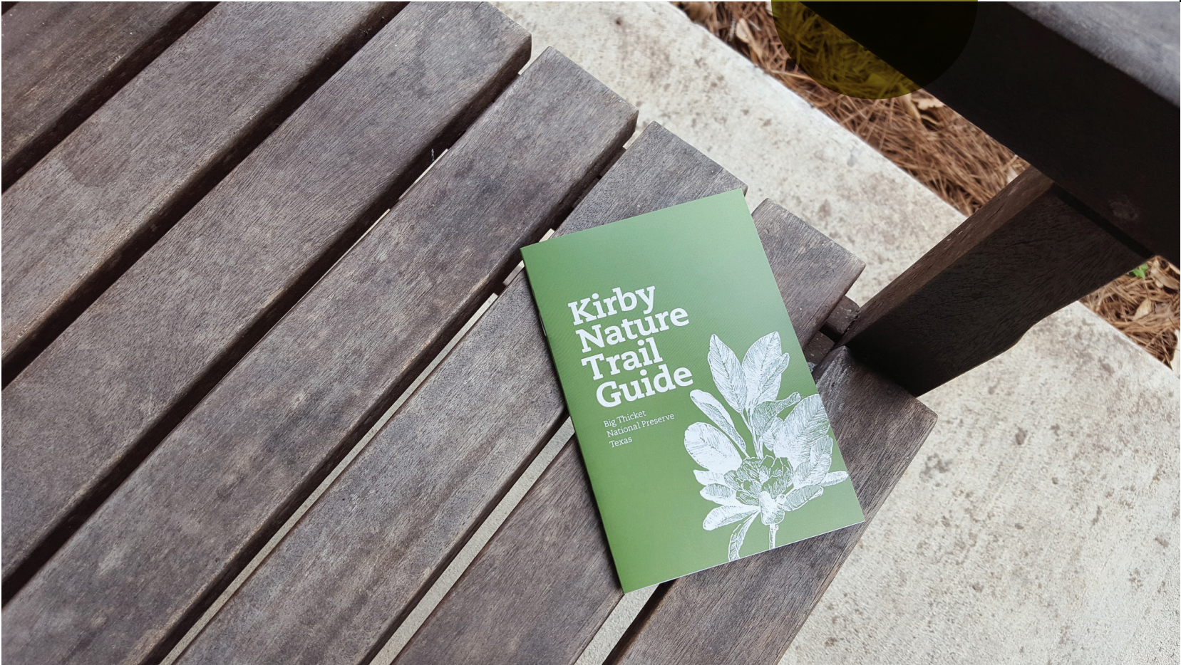
The Kirby Nature Trail at Big Thicket National Preserve has updated signage and a new trail guide.

Big Thicket National Preserve recently completed upgrades to signage along the Kirby Nature Trail. This trail, comprising the 1.5-mile Inner Loop, 2.4-mile Outer Loop, and 0.3-mile Cypress Loop, is located near the Big Thicket Visitor Center. It offers trail walkers a look at some of the many diverse ecosystems preserved at Big Thicket, including a slope forest and cypress slough. In addition to new signage, the park also released a new interpretive trail guide which highlights many key features of the biodiverse environment. The updated trail guide is available for purchase in the visitor center and was completed with support from WNPA.