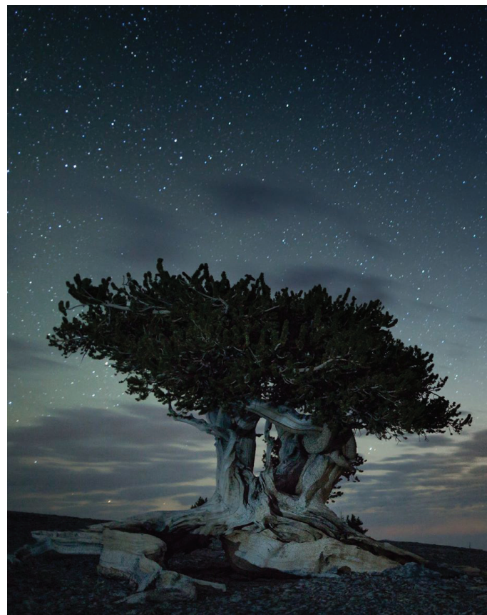
Great Basin National Park is one of 23 NPS sites designated as Dark Sky Parks.