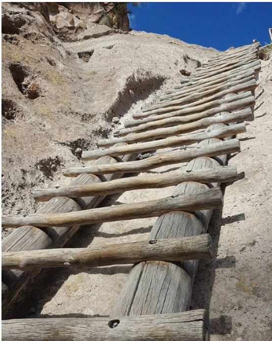
Bandelier National Monument (courtesy of @pampowellphoto ).