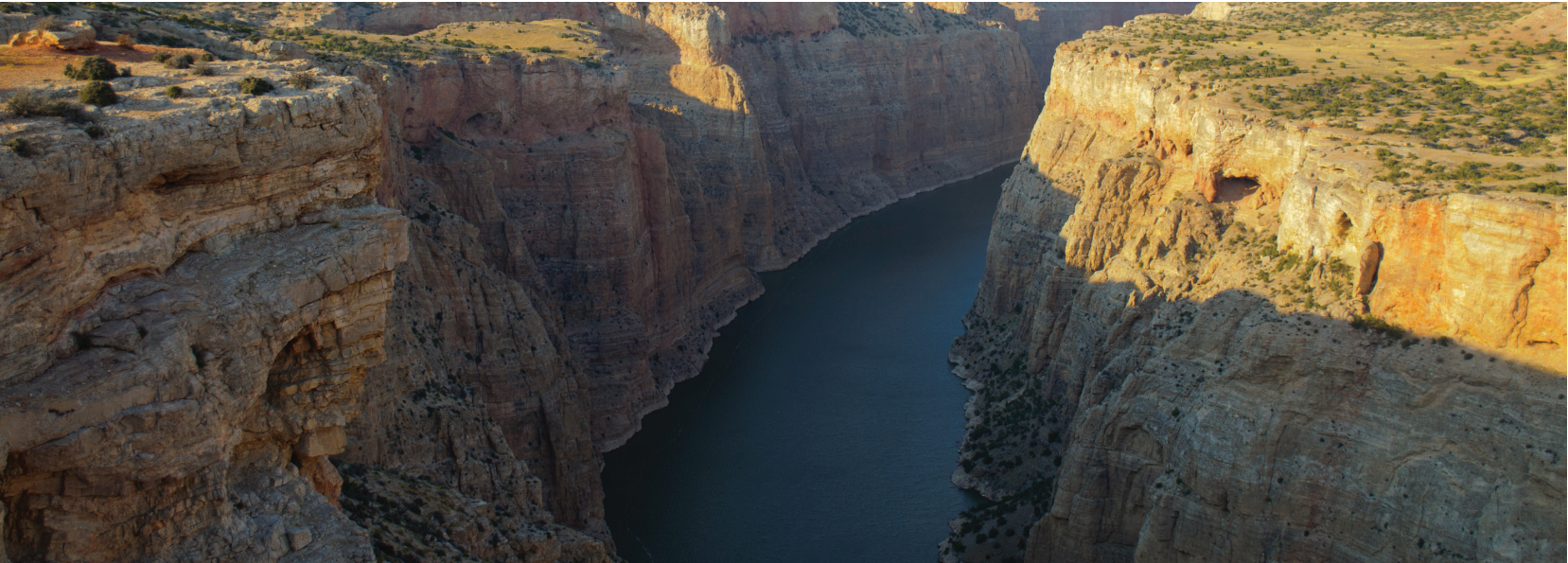
Bighorn Canyon.