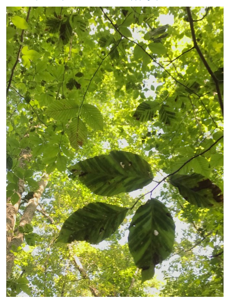
Photo: Beech leaves showing characteristic striping of beech leaf disease.

American beech (Fagus grandifolia), the most common tree species in National Capital Region parks, is currently facing the emerging threat of Beech Leaf Disease (BLD). And throughout the east coast this year, beech leaf disease is suddenly very common. In the NCR, it has spread within Prince William, out from where it was originally identified in 2021. Read more about this challenge: Beech Trees in the National Capital Area (U.S. National Park Service) (nps.gov)