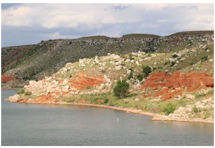
Boulders of the white Alibates Dolomite cascading down hillslopes made up of Permian redbeds are one of the characteristic features of the scenery of Lake Meredith NRA and Alibates Flint Quarries NM

The <u>SOPN Geodiversity Atlas</u> pages were completed via collaboration between SOPN and the GRD.