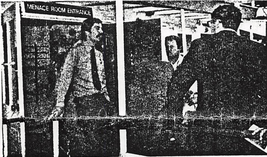
PHOTOS FROM MEET ME AT THE FAIR