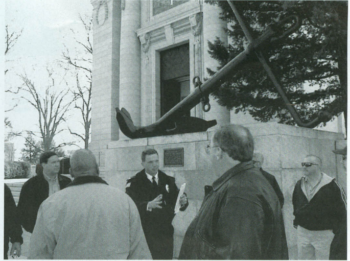
PLEA Board Members on tour of the Naval Academy at Annapolis

Your customer is the victim of a crime, who you've been able to guide through the complicated judicial process to a successful prosecution.