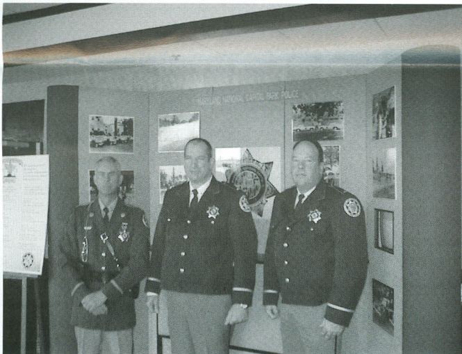
Three of Prince George's finest staff their information booth.

Your customer is the retired community center volunteer who waves to you as he leaves the facility for the evening, safely reaching his car in the parking lot and heading home.