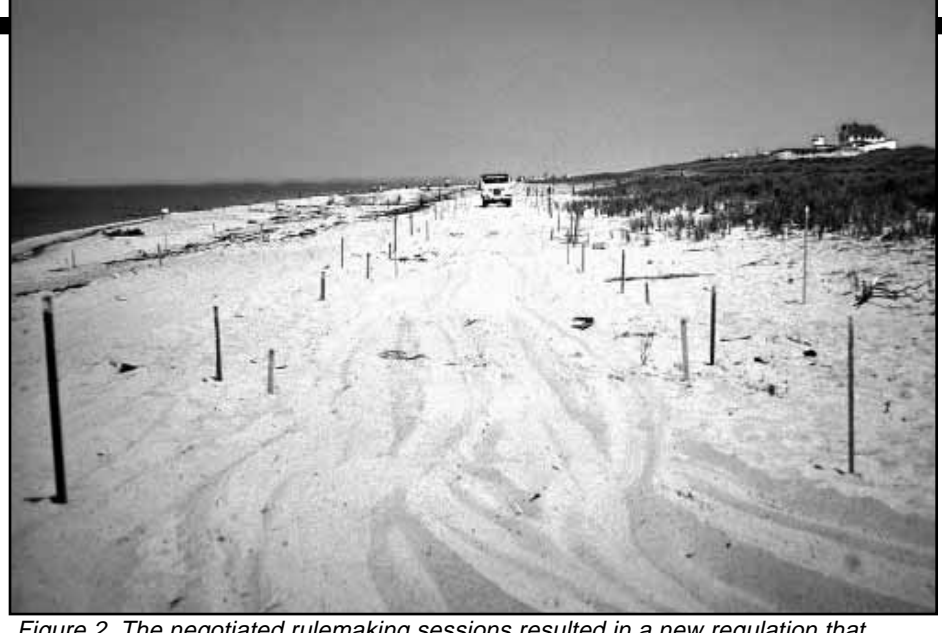
Figure 2. The negotiated rulemaking sessions resulted in a new regulation that closed a significant portion of the plover nesting beaches to off-road vehicle use. Elsewhere, ORVs are still restricted to a nonsensitive corridor, marked with stakes.

We began by identifying 23 groups (the maximum allowed is 25, although 6-7 is more common) that had a long-term interest and involvement in this issue. The organizations included state agencies, the six towns that the seashore is located within, ORV user groups, environmental