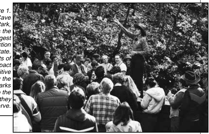
Figure 1. Mammoth Cave National Park, Kentucky, is the single largest resource attraction in the state. Assessments of economic impact applied in positive ways can draw the national parks closer to the communities they serve.

because they are based on low multipliers, and do not take full account of all economic factors. State generated models (and the one described in the preceding feature article) generally yield much higher impact figures, higher by 25-40%. Whatever model is used, the results are extremely important as barometers of the economic worth of the national parks locally, regionally, and even statewide. Because Mammoth Cave National Park is the single largest resource attraction in Kentucky (fig. 1), the impacts it generates are noticed at the highest levels of state government. When the impacts of the four Kentucky national park units are considered, our worth to the economic well-being of the commonwealth is fully appreciated.