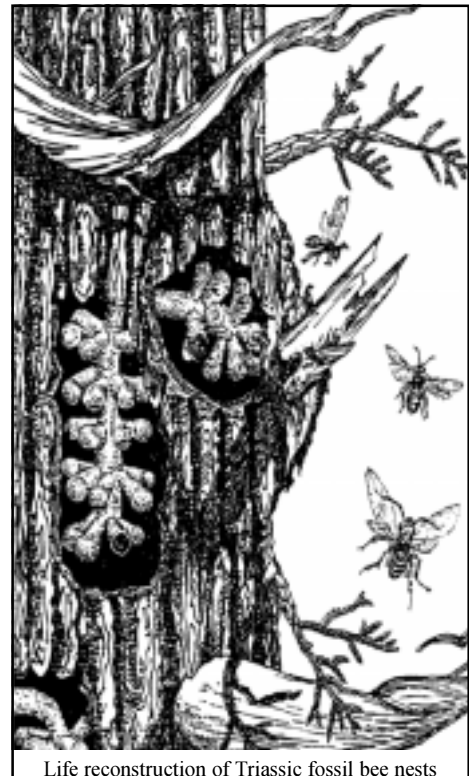
ife reconstruction of Triassic fossil bee nests in a conifer, Araucarioxylon arizonicum

tional Park. The first reports on paleontological inventories for Bryce Canyon National Park, Denali National Park and Preserve, Great Smokey Mountains National Park, Mammoth Cave National Park, and Ozark National Scenic Riverway are included in this volume. The multiple park ecosystem project on the Morrison Formation, a joint USGS and NPS collaboration, is reported on in this issue. A compilation of such a wide scope of paleontological research is invaluable. The quest for knowledge about the history of life is a continuous endeavor that these devoted researchers work on. This type of information can only enhance the understanding of the wonderful paleontological resources in the National Parks.