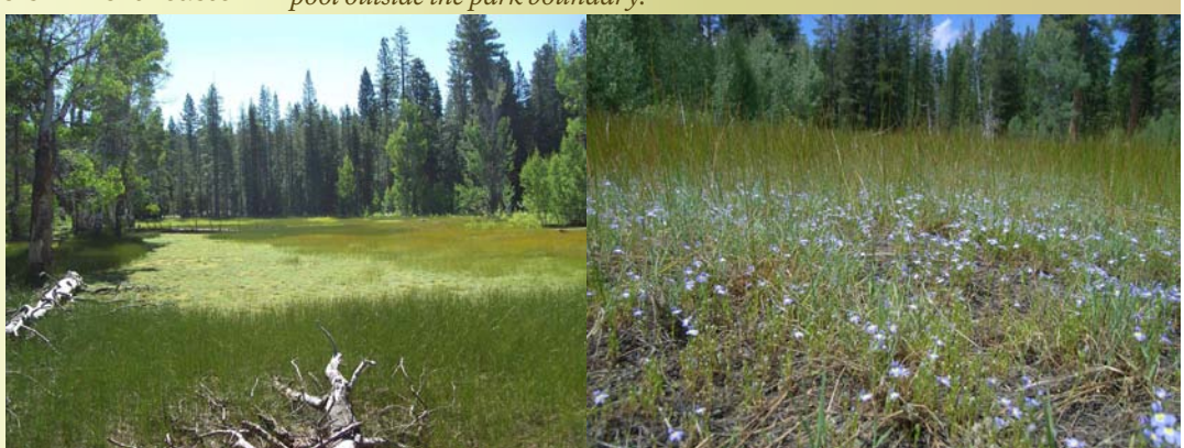
Figure 2. Lassen Volcanic vernal pools dry down in June-July. This is an optimal time for plant growth because the standing water is gone, soil is still moist, and the weather is at its warmest. Dominant plants on the right image are: Eleocharis macrostachya (green) and Porterella carnosula (blue).