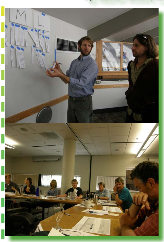
Participants discuss the Resource Stewardship Strategy components at workshops Lava Beds National Monument.

By Heather Rickleff, Lava Beds National Monument