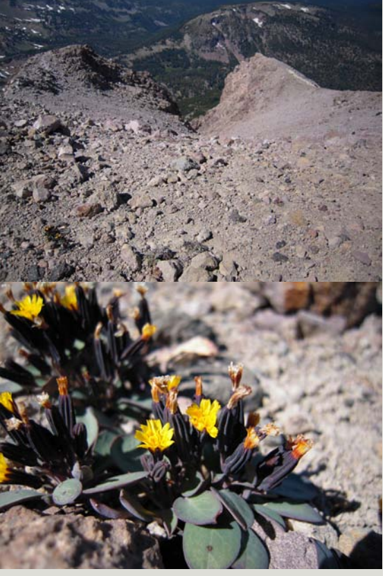
Dwarf alpine hawksbeard growing on Lassen Peak (top) and in detail (bottom).

While sampling Lassen Peak, as part of the vegetation mapping effort, we observed an unknown plant. It didn't fit the description of any species in the Flora of Lassen, and without proper magnification, the Jepson Manual was of no use. What could this species possibly be? Upon returning to the Ashland office, I was able to identify the unknown species as Dwarf Alpine Hawksbeard (Crepis nana). Here, I hit another obstacle: the physical characteristics fit but the distribution did not. It seemed the species was out of place on Lassen Peak. The only collections of C. nana in California were from the central/southern Sierra Nevada and the desert mountains near Death Valley. Further research revealed the species occurs at high elevations/latitudes on grav-