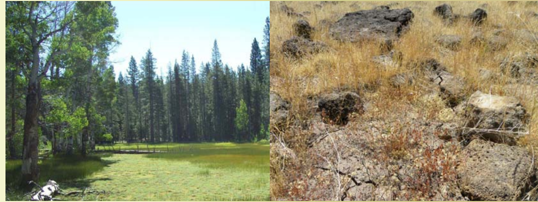
Figure 3. Vernal pools dry out completely in August-September. Their soil has cracks; most vernal pool plants set seeds and die. Dominant plants on the right image are: <u>Deschampsia danthonioides</u> (yellow), <u>Polygonum polygaloides ssp. confertiflorum</u> (brown), and <u>Navarretia leucocephala ssp. minima</u> (whitish).

Our data show that pools found in Lassen Volcanic and its vicinity are good representatives of Modoc Plateau vernal pools. Over 90% of California vernal pools have been destroyed and none of the remaining pools have as high a level of protection as the National Park Service can provide. The diversity of vernal pools within the park and especially in the areas adjacent to the park need further study. This knowledge can be incorporated in the management strategy to support sustainable existence of biodiversity of the Modoc Plateau region.