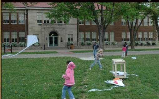
South American museum managers observed local community use of the park at Brown V Board of Education NHS

U.S. National Park Service U.S. Department of the Interior