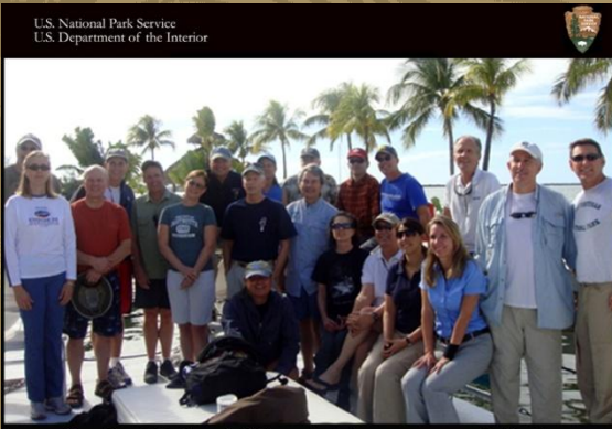
Canadian, Mexican & U.S. protected area managers during the North American Wilderness & Protected Areas (NAWPA) meeting.