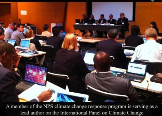
A member of the NPS climate change response program is serving as a lead author on the International Panel on Climate Change