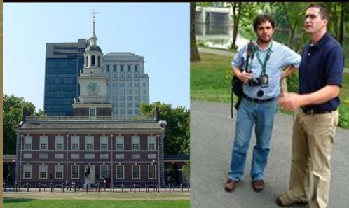
Peruvian archeologist during his World Heritage Fellowship at Independence National Historical Park