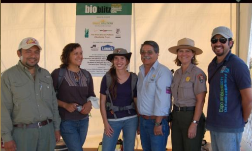
Saguaro National Park Superintendent (2nd from right) with staff from Mexico's San Pedro Martir National Park during BioBlitz 2011