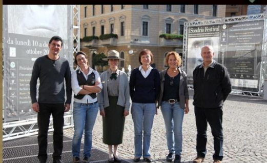
NPS ranger with fellow members of the film jury for the 2011 Sondrio Film Festival.