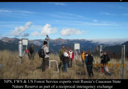
NPS, FWS & US Forest Service experts visit Russia's Caucasus State Nature Reserve as part of a reciprocal interagency exchange