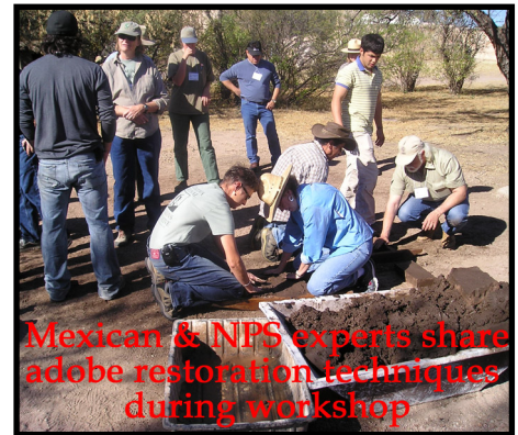
Mexican & NPS experts share adobe restoration techniques during workshop