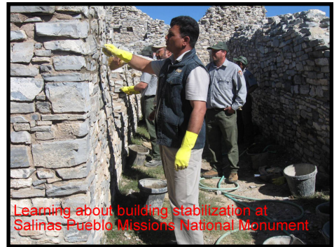
Learning about building stabilization at Salinas Pueblo Missions National Monument