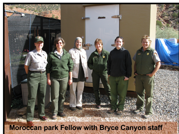
Moroccan park Fellow with Bryce Canyon staff