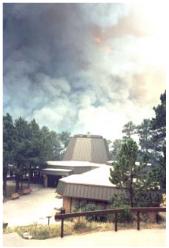
The Jasper Fire approaches the Jewel Cave Visitor Center, August 2000.

The Jasper Fire of August 2000 burned over 83,000 acres in the Black Hills and 90% of Jewel Cave National Monument. The lack of tree cover following the fire has decreased evapotranspiration, increasing surface runoff. Over the weekend of July 7 and July 8, 2001, two inches of rain fell in two 45-minute events, causing significant flash flooding in Hell Canyon and Lithograph Canyon.