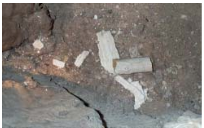
(3) Small pieces of broken drapery near Jim White's Tunnel in the Big Room.

A separate incident on June 9 occurred when two visitors were found hiding off the paved trail in the Queen's Chamber in possession of three freshly broken stalactites, drug paraphernalia and several grams of marijuana. The pair were charged with destruction of natural resources, being off the paved trail and entering a closed area,