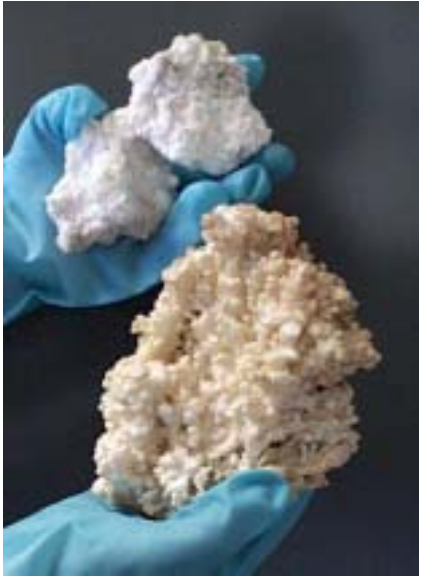
(2) Broken aragonite pieces recovered from area between the Boneyard and the Big Room.

Carlsbad Cavern Vandalism - Vandalism continues to be a problem in Carlsbad Cavern. Recent incidents have included: (1) A large piece of aragonite/calcite popcorn was broken in the Underground Concessions area. (2) At a point between the Boneyard and Big Room Junction, several large pieces of aragonite/calcite had been broken by someone climbing up a slope off the trail. Smaller pieces were also scattered in the same area. (3) Several large broken pieces of drapery were scattered along the floor of Jim White's Tunnel. A number of smaller pieces were scattered along the trail from the Doll's Theater to Jim White's Tunnel.