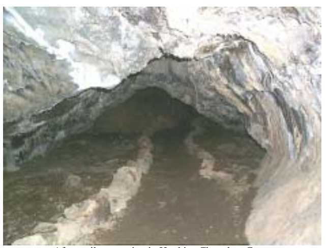
After trail restoration in Hopkins Chocolate Cave.

Cave Inventory - Cave inventory is moving right along at Lava Beds – I've recently converted the old dBase III databases into a streamlined MS Access system, similar to the one I designed for Wind Cave. We're attempting to round up years worth of lost survey notes to complete the cave files. Many of them have been lost for good, but we're making a dent in the missing data. The numbering, monumenting, and locating by using Global Positioning