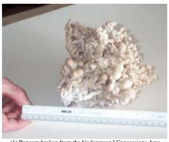
(1) Popcorn broken from the Underground Concessions Area.