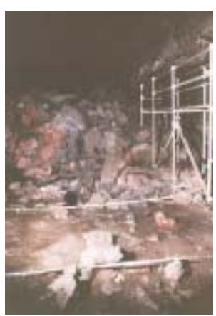
Photo on the left was taken in 1991 showing extent of ice in Merrill Ice Cave. Photo on the right was taken in 2000 documenting loss of ice.

Our bat-monitoring program is also in full swing. Initial results of the Corynorhinus outflight counts show a stable population trend. We've managed to keep tabs on the ladies quite well this summer. The results aren't in on the Tadarida colony, but the visual estimation still says there's a bunch of bats out there.