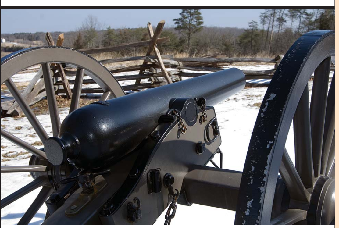
The Digital Imaging Project captures photos of objects both large and small. Top: Manassas National Battlefield Park catalog number 184 is a Union eagle breastplate worn on a cartridge box strap or cross belt. Above: Manassas catalog number 873 is a three-inch Confederate rifle made at the Nobel Brothers Foundry in Rome, Georgia. It was captured at Cedar Creek, Virginia on October 10, 1864.