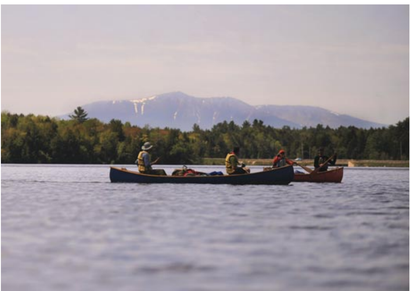
The East Branch of the Penobscot River flows through part of the new monument, from which one can take in excellent views of Mount Katahdin.

quiet water, to its vantages for viewing the Mount Katahdin massif, the 'greatest mountain.'" New and beguiling vistas emerge when the sun sets: "The area's night skies rival this [daytime] experience, glittering with stars and planets and occasional displays of the aurora borealis, in this area of the country known for its dark sky."<sup>8</sup>