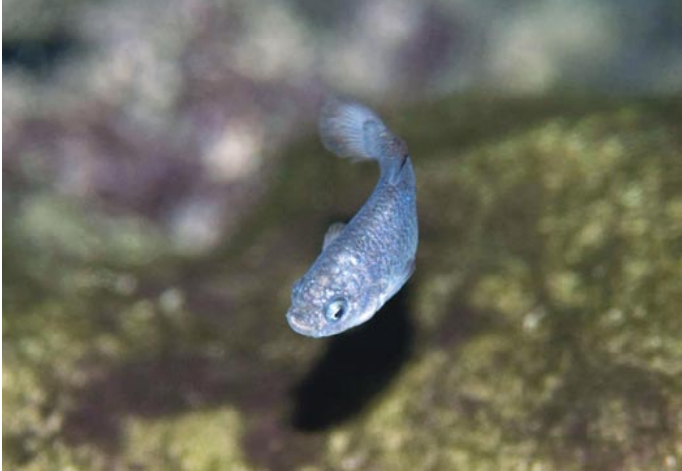
This iridescent blue inch-long fish's only natural habitat is in the 93 degree waters of Devils Hole, located in a detached unit of Death Valley National Park in Nevada. Although the cavern is more than 400 feet deep, the pupfish are believed to spawn exclusively on a shallow rock shelf just under the surface.

Scientists understood that the biota of desert springs like Devils Hole was especially sensitive to human disruption, since the scarcity of water in arid areas made springs valuable for development. In 1928, Harvard University entomologist Charles Brues cautioned that "all except the most inaccessible" springs in the West had already "been converted into natatoria, sanatoria for arthritics, radium baths and the like, or have been diverted into irrigation ditches, sometimes with the aid of dynamite, to supply a few desolate ranches with water for cattle and alfalfa."7 As early as 1914, two ranchers proposed a scheme to irrigate their land with water from Devils Hole.8 And though the site remained undeveloped, researchers nonetheless saw reason for concern. Robert Rush Miller, a young University of California ichthyology student and future authority on the taxonomy of desert fishes, visited Devils Hole in 1937 and worried about the pupfish's future. "C. diabolis was found to have been reduced to not more than fifty or sixty fish," many less than seen on his previous visit, he wrote. "At this rate it won't be long until they are extinct."9 Miller had overstated the precariousness of the population, but his fear that