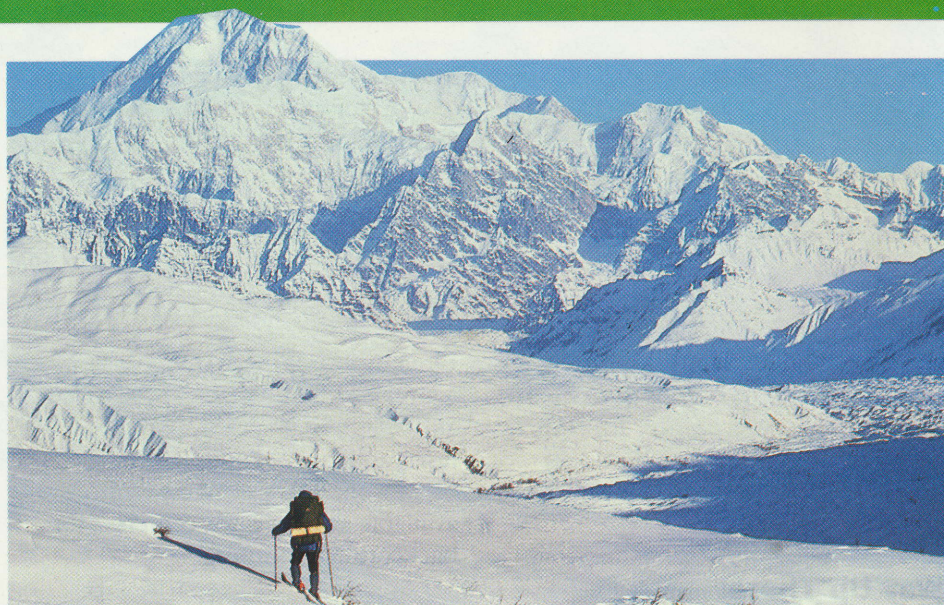
Denali National Park

Furthermore, the crowds are thinner this time of year—but don't tell anybody—and the frozen winter vista opens up many areas in the parks that are difficult to travel over during the summer when the snow melts and the ground is wet. Now you can