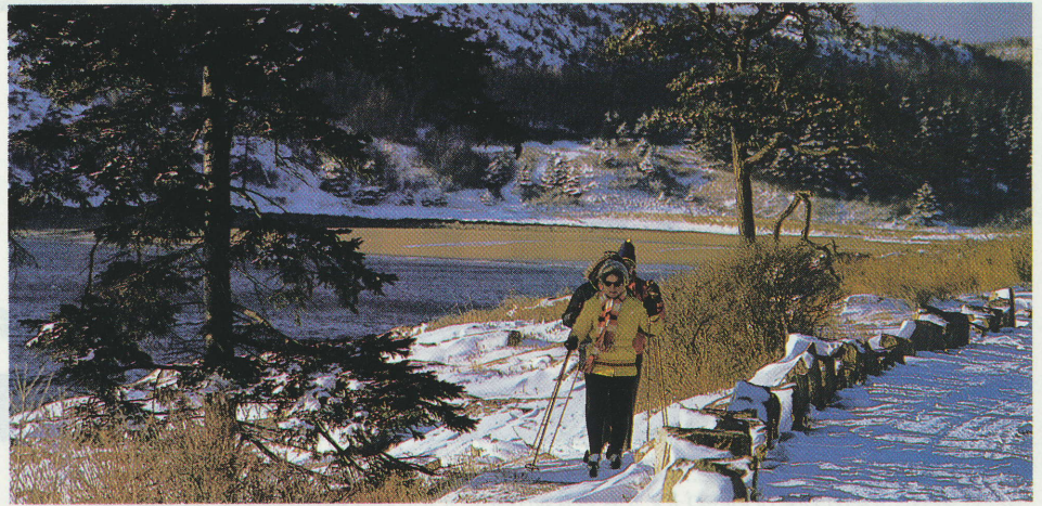
Acadia National Park

A permit is required for snow camping, backpacking and mountain climbing, plus common sense and safety concerns. Before embarking on these pursuits, register with a park ranger and get information on avalanches, proper gear and clothing, and on hazardous weather conditions.