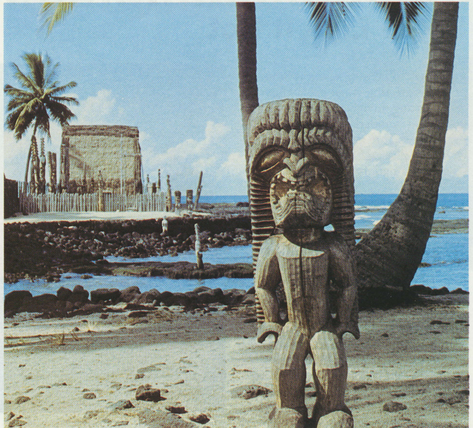
Pu'uuhonua o Honaunau National Historical Park

The ideal way to start your visit is at the park's Cruz Bay Visitor Center, located a short walk from the ferry dock on the western side of the