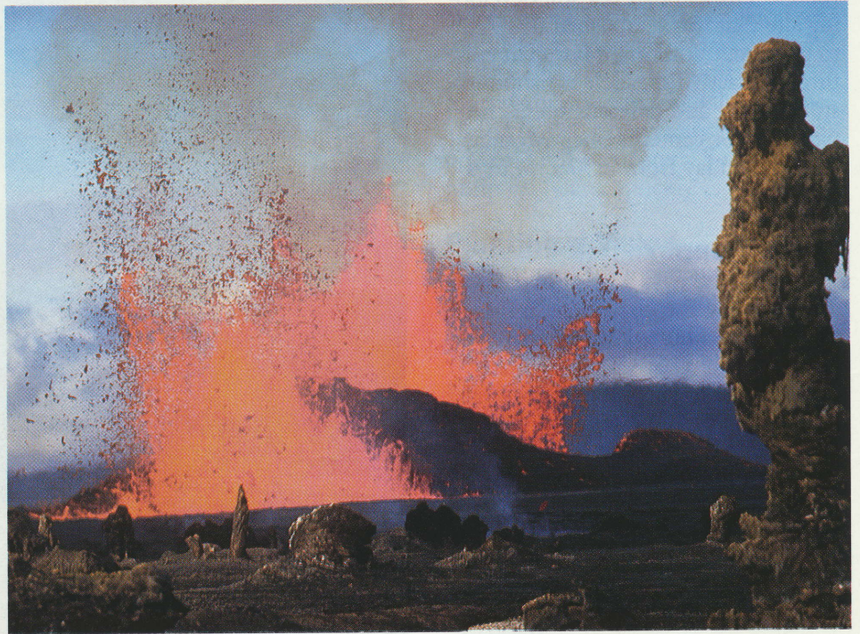
Hawaii Volcanoes National Park

The park offers hiking, crater rim drives, mountain climbing, camping