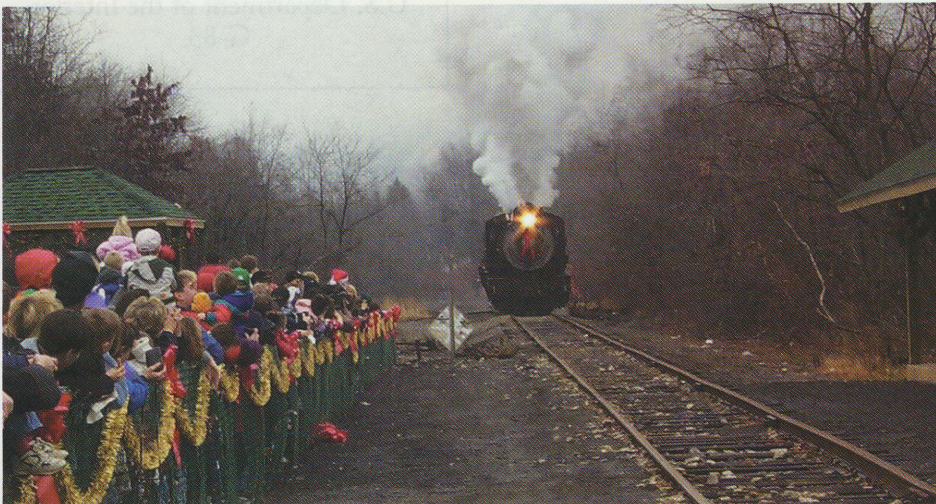
Steamtown National Historic Site

Park attractions include Dr. Carver's birthplace site and the grounds he covered as a young boy: a trail, woodland area and prairie; a spring and pond, a persimmon grove, plus a Carver bust, a statue, family cemetery, and the Moses Carver farm house. There is also an ash hopper that was used to store ashes to make lye soap.