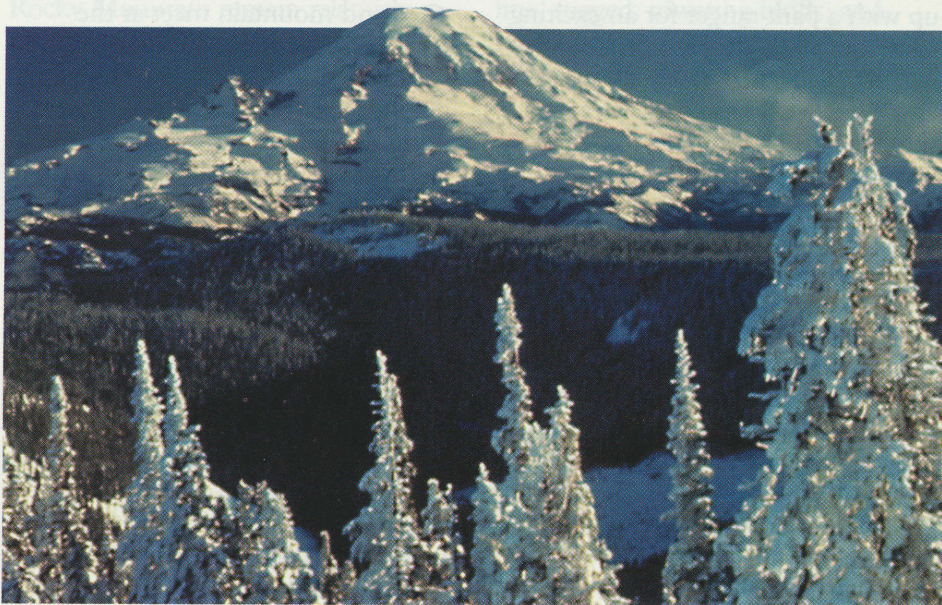
Mount Rainier National Park

Take for example Mount Rainier National Park , a grand landscape of forests, glaciers, streams and valleys dominated by a hulking 14,410 foot mountain—a slumbering volcano—that on a clear day you can see all the way from Seattle, Washington, some 95 miles away. An offspring of fire and ice, Mount Rainier was born a half-million years ago on a base of lava spewed out by previous volcanoes. Today the park is a major icon of the northwest, an easy drive from Seattle, Tacoma, and Portland, Oregon.