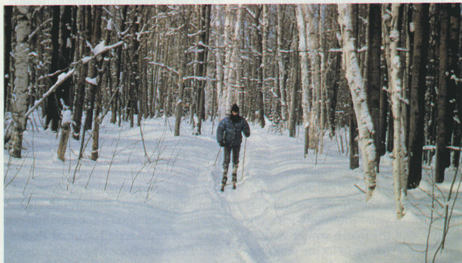
Sleeping Bear Dunes National Lakeshore

The shore was formed millions of years ago when glaciers spread southward from Canada and carved out the wide, deep basins of the Great Lakes. The glaciers also dumped huge piles