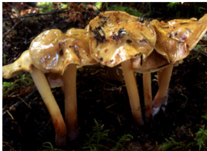
Phaeocollybia gregaria is an endemic Oregon gilled mushroom thus far verified only from the Cascade Head Experimental Forest (Lincoln County) and a 150year old BLM Reserve Forest near Pedee in near-by Polk County.

The BLM approached the Institute of Natural Resources and the Oregon Natural Heritage Information Center and requested that the program evaluate the second question for all of the Survey and Manage Species. The lawsuit required that the BLM and USFS develop this information and complete the EIS in less than six months. As a result, the Information Center was given barely 2 months to put together a team of experts to evaluate the status of each of the 312 species throughout their entire global range, as well as in each of the three U.S. States (Washington, Oregon and California) covered by the Forest Plan. The status evaluation required the development of Heritage Global and State Ranks. Each rank was developed by evaluating the species abundance,