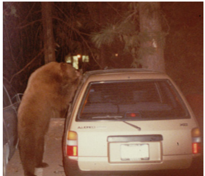
Photo from a University of Idaho/NPS project final report: Bear Element Assessment Focused on Human-Bear Conflicts in Yosemite National Park

For NPS projects: Unless otherwise noted, complete copies of all final products must be sent to the CESU office c/o the NPS Research Coordinator for archiving. In addition, three copies of all final deliverables must be sent to the NPS Columbia Cascades Support office. These requirements are clearly outlined in all NPS Task Agreements. In addition, please send a short electronic abstract of results for inclusion on our web site to woodmant@u.washington.edu .