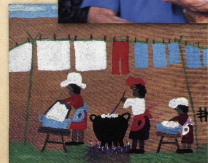
Wash Day by Clementine Hunter