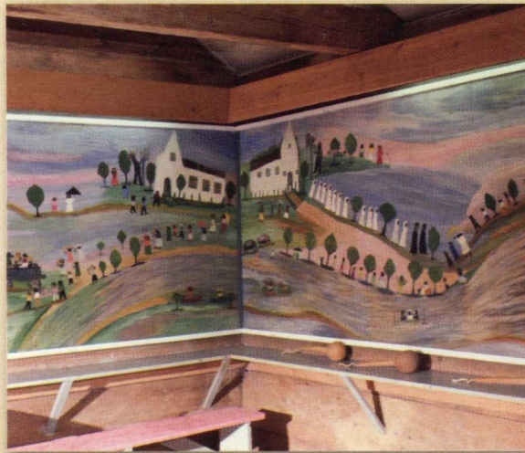
African House Mural