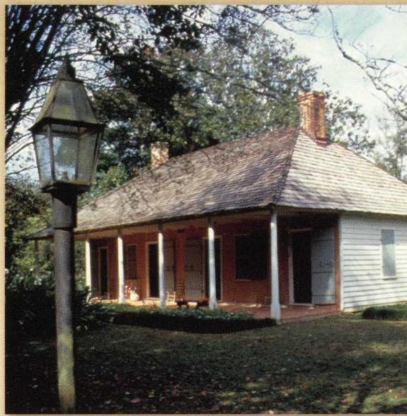
The Yucca House