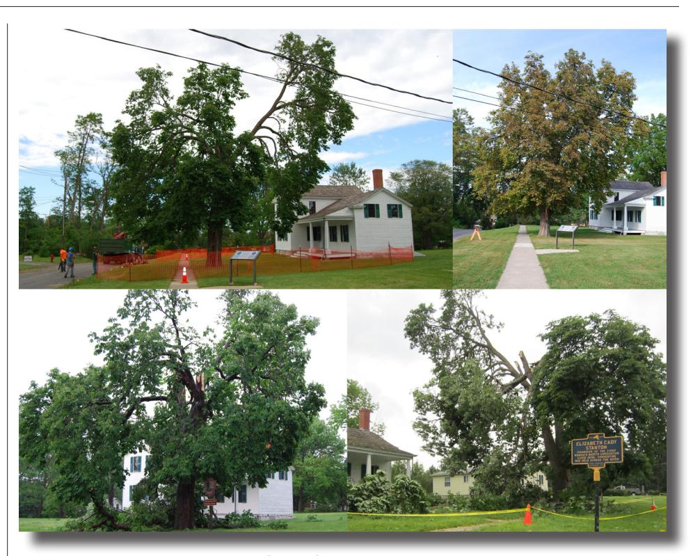
The Horse Chestnut witness tree in front of the Elizabeth Cady Stanton House took a big hit on May 29 when a strong storm cell passed through the Washington Street, Seneca Falls neighborhood. Image top right shows tree before the storm. See page 3 for more.

As you approach and enter the Wesleyan Chapel, imagine that you are walking in the footsteps of the organizers and participants of the First Women's Rights Continued on page 2