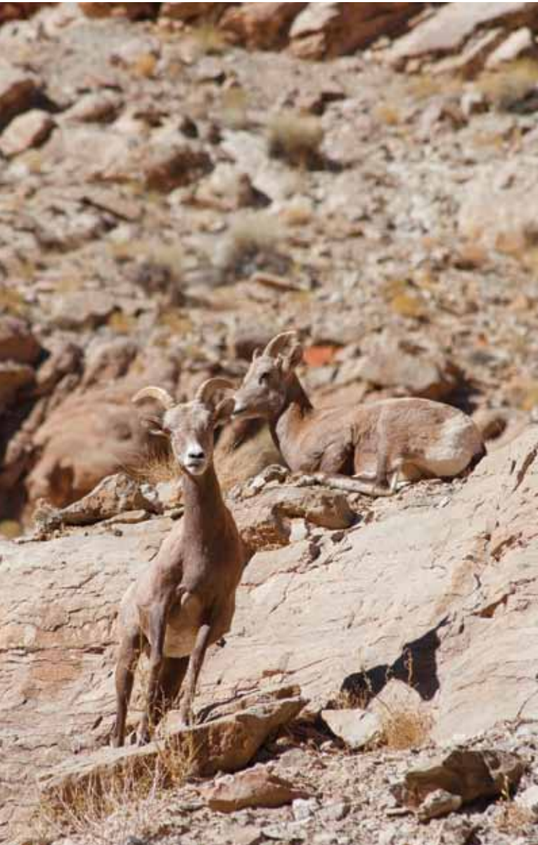
Bighorn sheep at Canyonlands National Park.

P residents of The Wildlife Society (TWS) occasionally appoint ad hoc committees to study and report on selected conservation issues. The resulting technical review presents technical information and the views of the appointed committee members, but not necessarily the views of their employers.