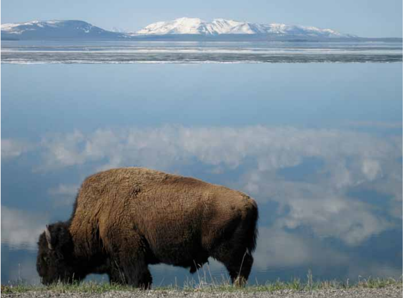
Bison (Bison bison) at Yellowstone Lake. Bison management is an ongoing need within the boundaries of Yellowstone National Park.