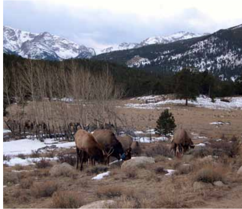
Over-populations of ecological keystone species, such as elk, deer and bison can negatively affect floral and faunal community dynamics. Here, excessive elk grazing limits aspen regeneration, which negatively impacts beaver and other vertebrate and invertebrate populations.

In contrast to Yellowstone, Riding Mountain National Park (Riding Mountain) in Manitoba, Canada, is a small park considered to be an "ecological island situated amidst a sea of agriculture." Bovine tuberculosis was first confirmed in the park's elk in 1992 and in white-tailed deer in 2001 (Lees 2004, Nishi et al. 2006). Tuberculosis was routinely reported in cattle allowed to graze in Riding Mountain during the 1950s and 1960s. To facilitate trade in 2003, the Canadian Food Inspection Agency established the Riding Mountain Eradication Area and gave it a BTB-Accredited Advanced status, whereas the rest of Manitoba was designated as disease-free. Concern over elk and deer from Riding Mountain infecting cattle herds outside of the park led to the development of a 5-year management and eradication plan by the Interagency Task Force Group for Bovine Tuberculosis. Because of the extensive