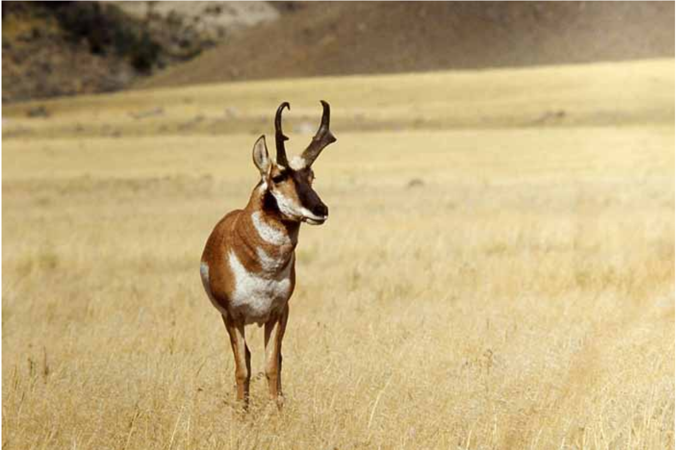
Pronghorn antelope in Yellowstone National Park.