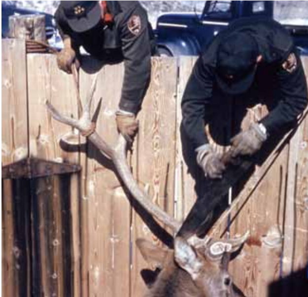
National Park Service personnel deantler an elk in a trap in Yellowstone National Park in 1959.