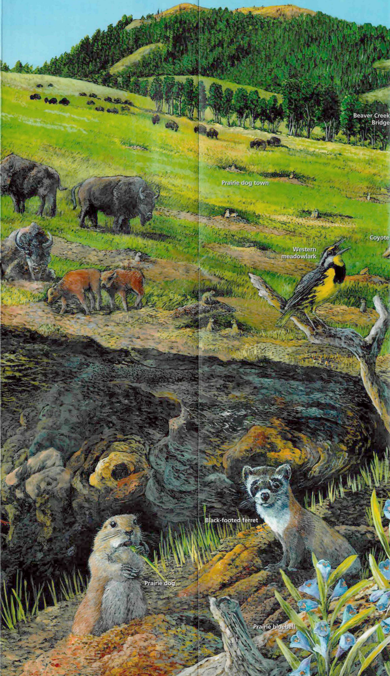
Prairie dog town