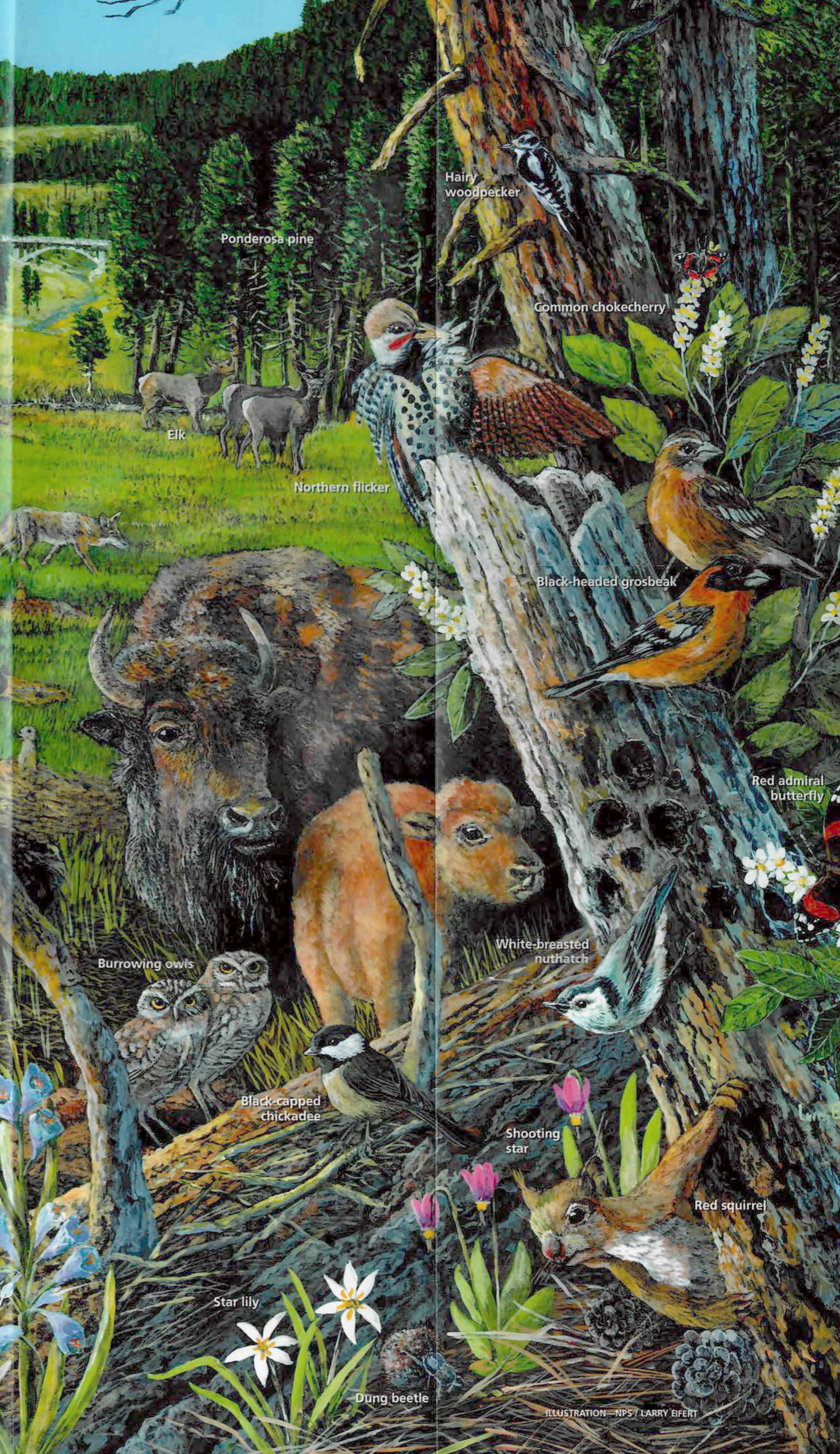
Beaver Creek Bridge