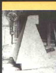
Library of Congress

except December 25 from 9 a.m. to 5 p.m., September through March; 8 a.m. to midnight, April through August. An elevator carries visitors to the 500-foot level in 70 seconds to see spectacular views of the city named for George Washington. A