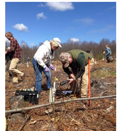
Top: Youngsters Enjoying the Grounds. Bottom: Planting Chestnut Trees at Milford Experimental Forest

Grey Towers National Historic Site • P.O. Box 188 • Milford, PA 18337 • 570-296-9630 • greytowers@fs.fed.us • www.fs.usda.gov/greytowers