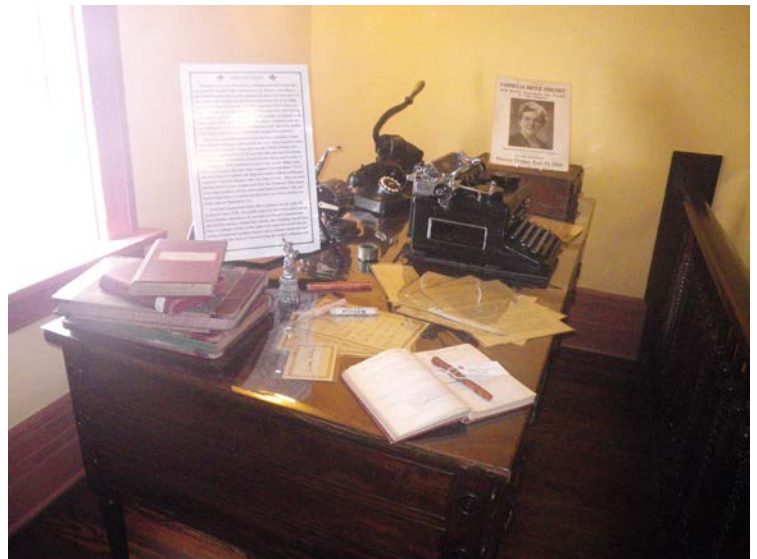
Cornelia Pinchot Exhibit

Looking Ahead: Visitors will appreciate and gain inspiration from Cornelia Pinchot's original design and vision with the restoration of the Long Pool and Garden.