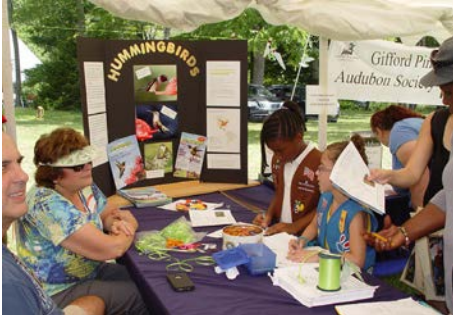
Top: Gifford Pinchot and His Canoe. Bottom: Audubon Exhibit at Festival of Wood

of a variety of wood products; and coordinated with the Pinchot family and the American Chestnut Foundation to plant 465 American Chestnut seedlings at the Milford Experimental Forest;