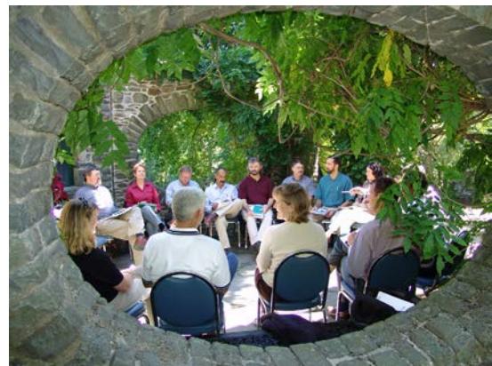
Fingerbowl workshop inspiration