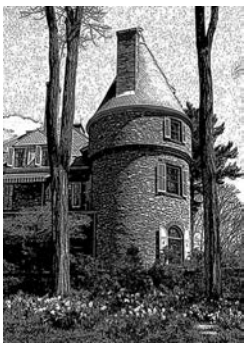
Grey Towers in springtime

The USFS staff at Grey Towers continues to build upon Gifford Pinchot's leadership ethos and provides an intellectual and inspirational center for natural resource leadership development.