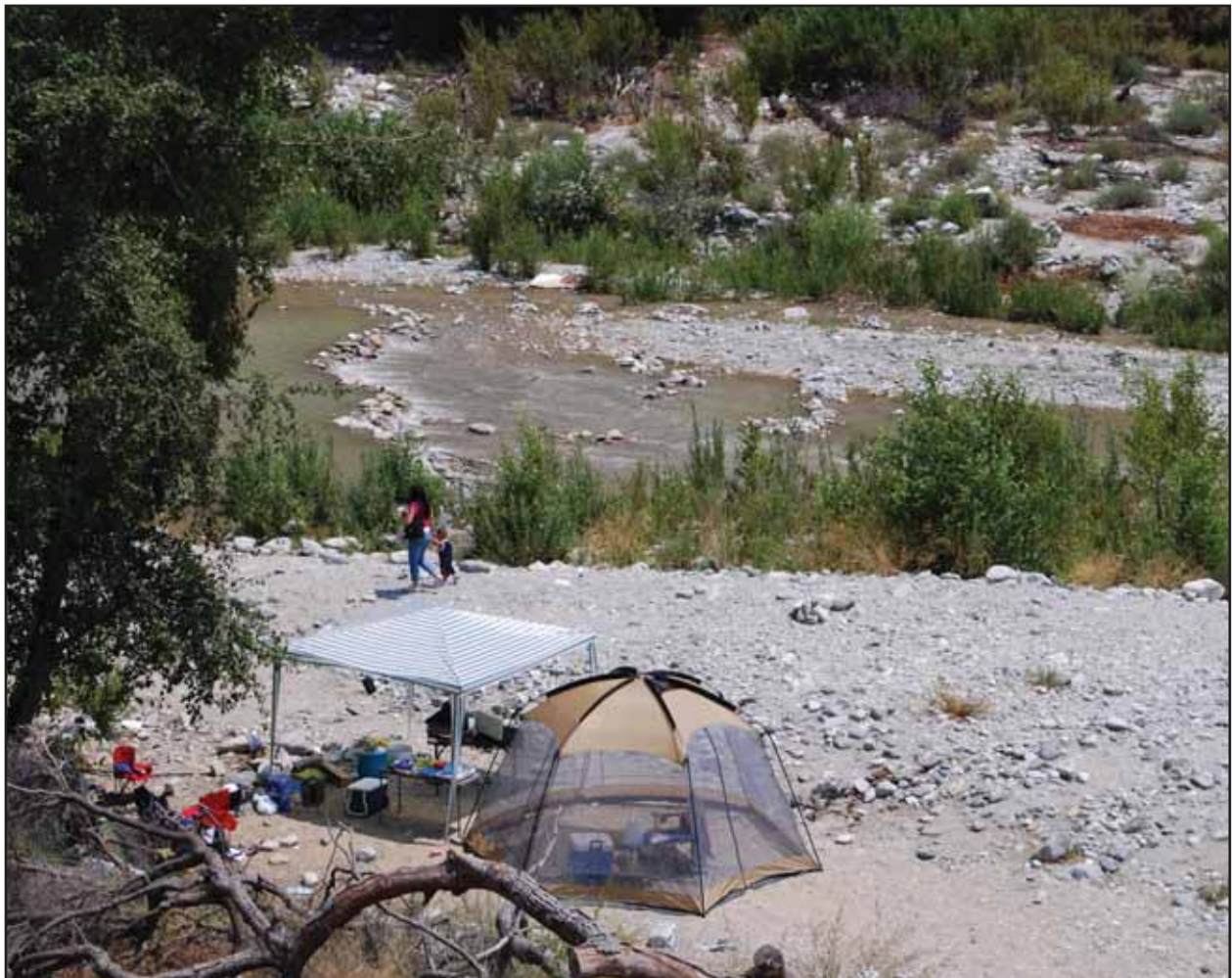
Day use activities, Angeles National Forest.

Alternative A would provide regional benefits to water quality and conservation. The early conservation of the San Gabriel Mountains was intended for watershed protection and this would be reaffirmed in both Alternatives A and D. Protection of watershed resources and additional restoration throughout the mountains would improve water quality both in the mountains and downstream. Alternative C would have benefits to the San Gabriel River watershed, through enhanced visitor management and education and restoration opportunities within the NRA. However, it would do nothing to improve the water quality of other watersheds located within the study area, such as the Los Angeles River, the Santa Clara River, and rivers that drain into the Antelope Valley.