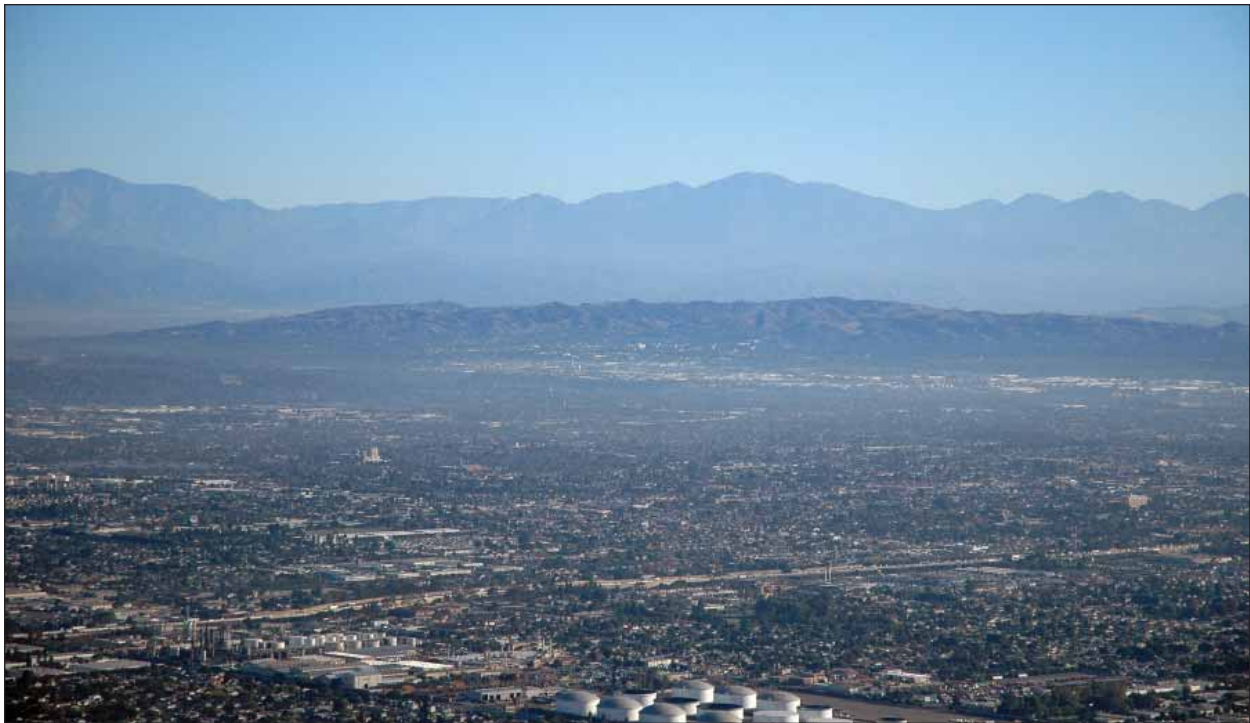
Puente Hills and the San Gabriel Mountains. 2006.