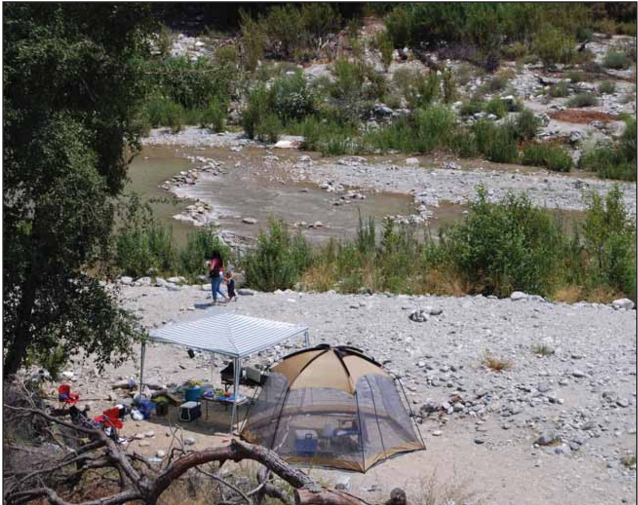
Day use activities, Angeles National Forest.

Alternative A would provide regional benefits to water quality and conservation. The early conservation of the San Gabriel Mountains was intended for watershed protection and this would be reaffirmed in both Alternatives A and D. Protection of watershed resources and additional restoration throughout the mountains would improve water quality both in the mountains and downstream. Alternative C would have benefits to the San Gabriel River watershed, through enhanced visitor management and education and restoration opportunities within the NRA. However, it would do nothing to improve the water quality of other watersheds located within the study area, such as the Los Angeles River, the Santa Clara River, and rivers that drain into the Antelope Valley.