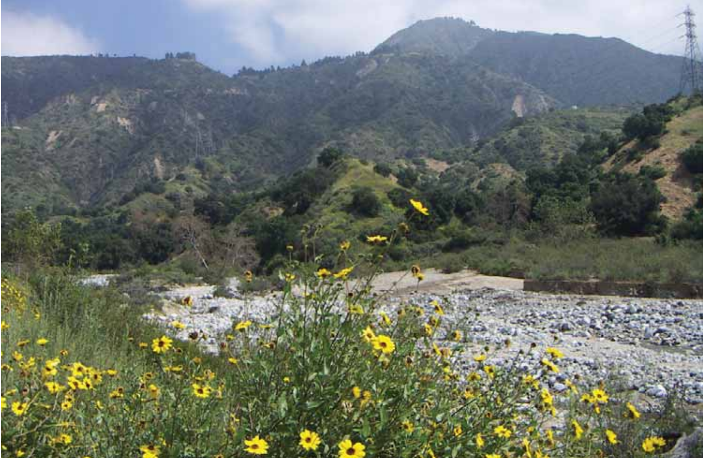
Top, left to right: Frank G. Bonelli Regional Park, Inspiration Point, Angeles National Forest, Bottom: Eaton Canyon Natural Area

U.S. Department of the Interior Washington, DC