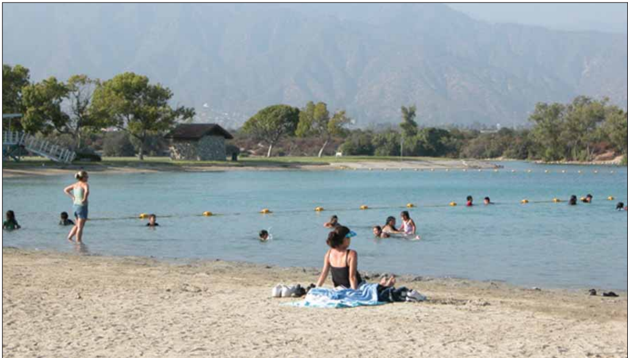
Santa Fe Dam Recreation Area. 2004.