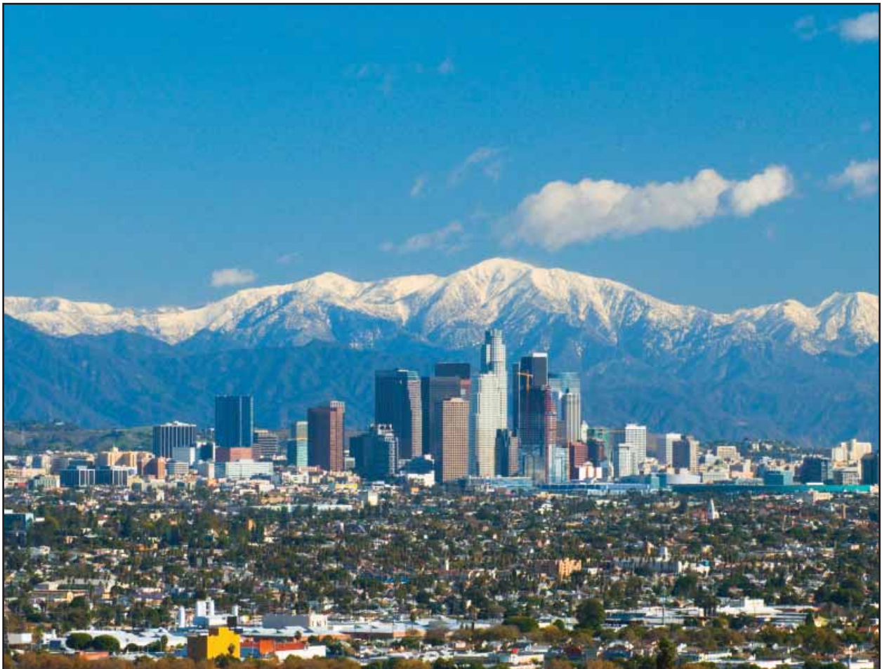
The San Gabriel Mountains with the Los Angeles urban area in the foreground.

After the distribution of the Draft San Gabriel Watershed and Mountains Special Resource Study there will be a minimum 90-day review period. The NPS study team will then revise the report if needed, and transmit it to the Secretary of the Interior. The Secretary will transmit the report to Congress, along with the Secretary's recommendation for the area.