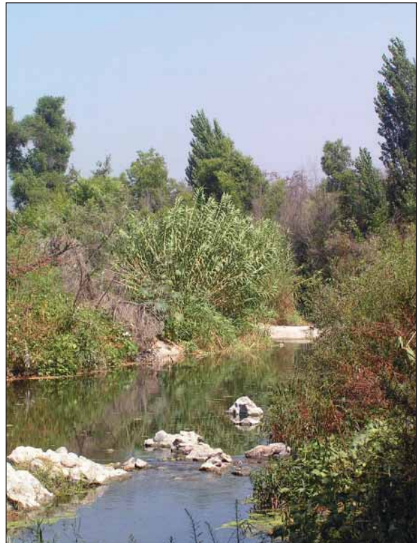
Whittier Narrows Recreation Area.

Operations and maintenance of existing parks and open space would be assumed to remain at current levels. For some agencies, more resources are available for the acquisition of lands than are available for operations and management.