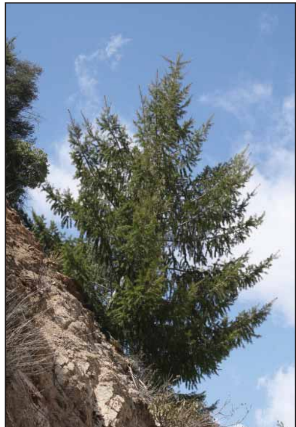
Bigcone Douglas fir.

The NRA partnership would be a coordinating body for existing grant programs, and could work together to leverage funds from a variety of sources (e.g. state bonds, Land & Water Conservation Fund) to increase funding for projects in the NRA.