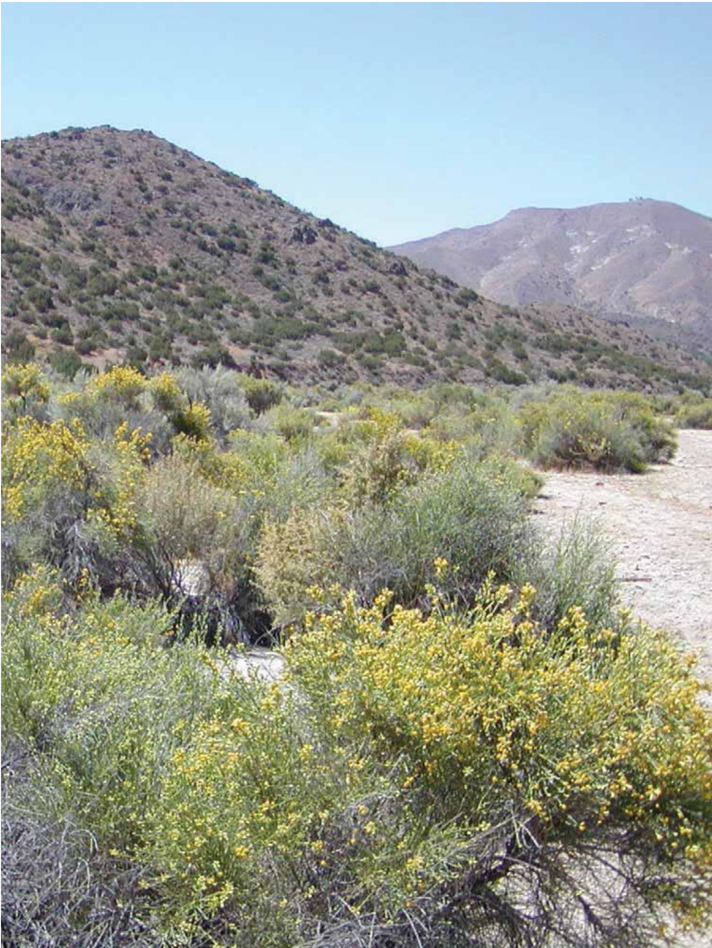
California Broom Sage, Santa Clara River near Acton.