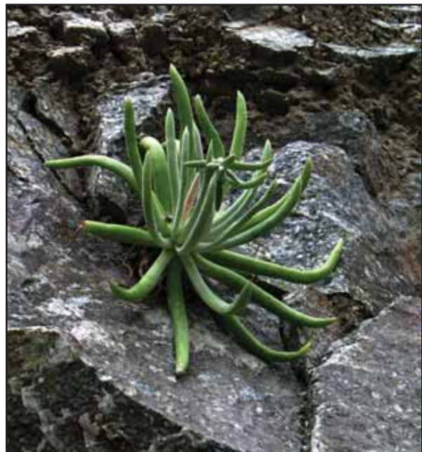
San Gabriel Mountain dudleya.