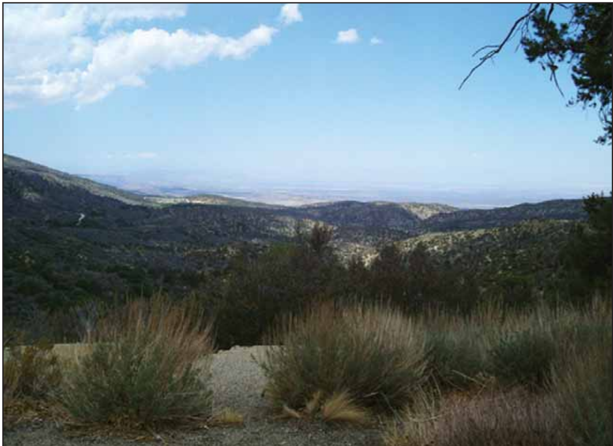
Antelope Valley. 2007.

No unit of the national park system would be established. Existing units of the NPS would continue current management. The Santa Monica Mountains National Recreation Area would continue to partner with the U.S. Forest Service, as it currently does, on an informal basis. The NPS would continue to provide technical and financial assistance to local communities through existing programs.