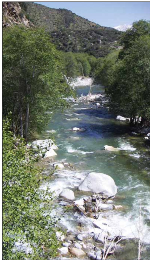
West Fork of the San Gabriel River. 2005.

The purpose of this special resource study is to determine whether any portion of the San Gabriel Watershed and Mountains study area is eligible to be designated as a unit of the national park system. Through the study process, the NPS identified alternative strategies to manage, protect, or restore the study area's resources, and to provide or enhance recreational opportunities. These alternatives explore partnerships and efforts to protect important resources in ways that do