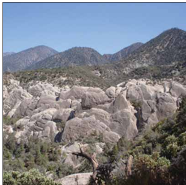
Photos (top to bottom): 1. West Fork Trail, Angeles National Forest. NPS photo. 2. Devil's Punchbowl. San Gabriel Mountains. 2006. NPS photo.