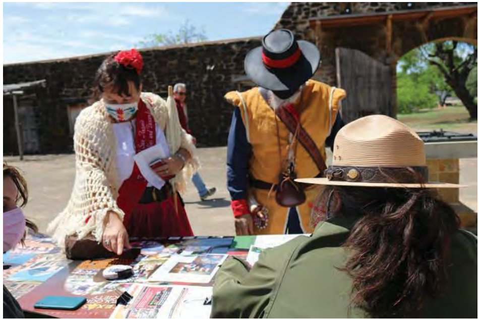
History and Genealogy Day

History and Genealogy Day San Antonio Missions National Historical Park hosted its annual History and Genealogy Day on April 17, 2021 as part of National Park Week. Families with ties to the missions interacted and shared their stories with national park visitors at Mission San Jos. Historical societies and institution were also present with information and genealogy research tools.