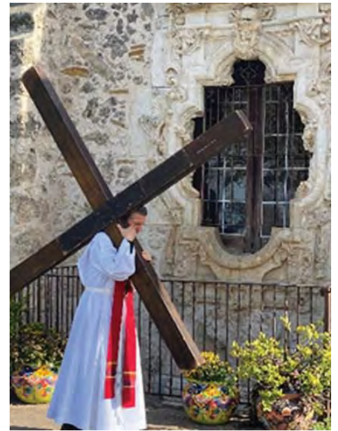
Archbishop carrying the cross