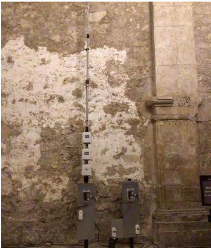
Moisture monitoring at the Alamo