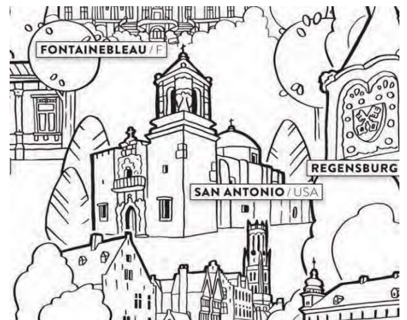
World Heritage Cities coloring poster 15

The World Heritage Office worked with the Organization of World Heritage Cities to launch a coloring poster for kids featuring several World Heritage Sites. The poster is available for free online , and kids can explore the San Antonio Missions by downloading the coloring sheet and coloring the printout.