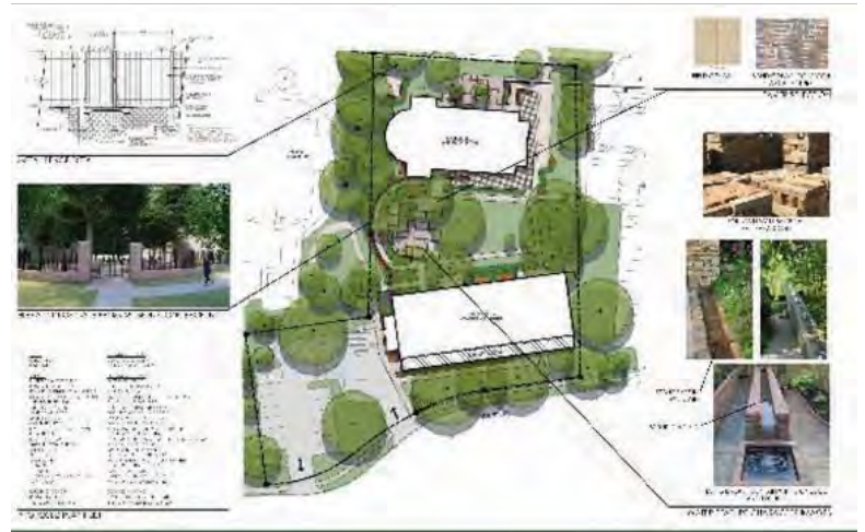
Rendering of the Pilgrimage Center

The building of a pilgrimage center began this year with the renovation of the St. John's Seminary Chapel and its Cafeteria. Located behind Mission Concepción, the pilgrimage center will provide information and support for visitors as well as space for conferences and events.