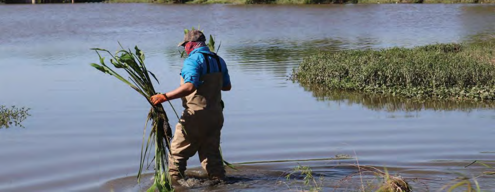
Relocating Sagittaria to the San Antonio River