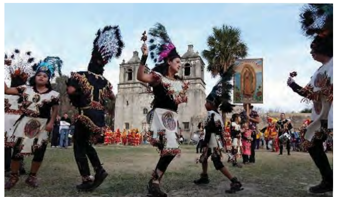
Matachines at Mission Concepción

Images of the Virgin of Guadalupe can be found in all of the mission churches. Many in San Antonio hold a fervent devotion to Our Lady of Guadalupe and her maternal presence. On December 11th approximately 400 matachine dancers departed from Mission San Juan and danced the entire way to Mission San José about 3 miles along Mission Reach trail in honor of the Virgin of Guadalupe with their intentions and prayers.