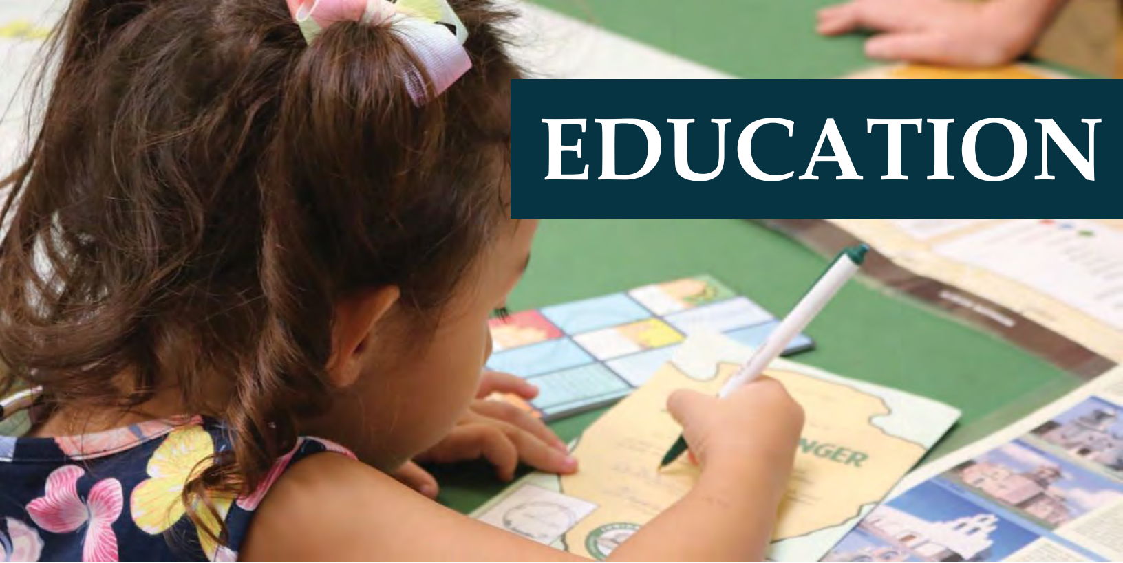
Junior Ranger signing her book