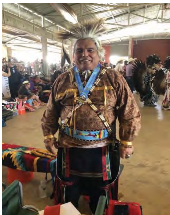
POW WOW at Mission County Park