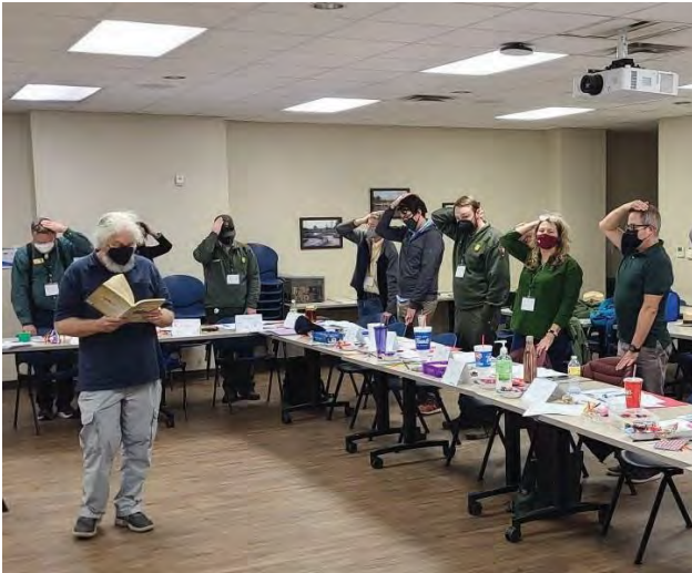
Certified Interpretive Guide training in 2021

San Antonio Missions National Historical Park hosted a week long Certified Interpretive Guide training for San Antonio Missions World Heritage educators and interpreters. Special thanks to Mission Heritage Partners for sponsorship. Participants included individuals from: Mission Heritage Partners, City of San Antonio World Heritage Office, San Antonio River Authority Archdiocese of San Antonio/Las Misiones and The Professional Tour Guide Association of San Antonio who joined the national park staff in this week long training.