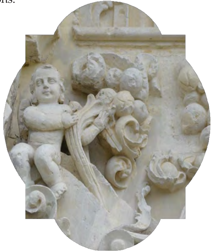
Angel on the San José church facade

The Conservation Society of San Antonio partnered with the National Park Service and El Camino de San Antonio Missions to produce Heritage Education Virtual Tours for Missions San José and Concepción. Designed for fourth graders studying Texas history, the virtual tours provided a safe way to bring the history of the World Heritage Missions and San Antonio to school children during the pandemic. The video production was supported by The Edouard Foundation, the Mirza Trust and HEB. They can be viewed on the Conservation Society website here .