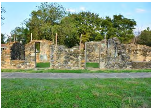
Old classroom and Cuellar House at Mission Espada