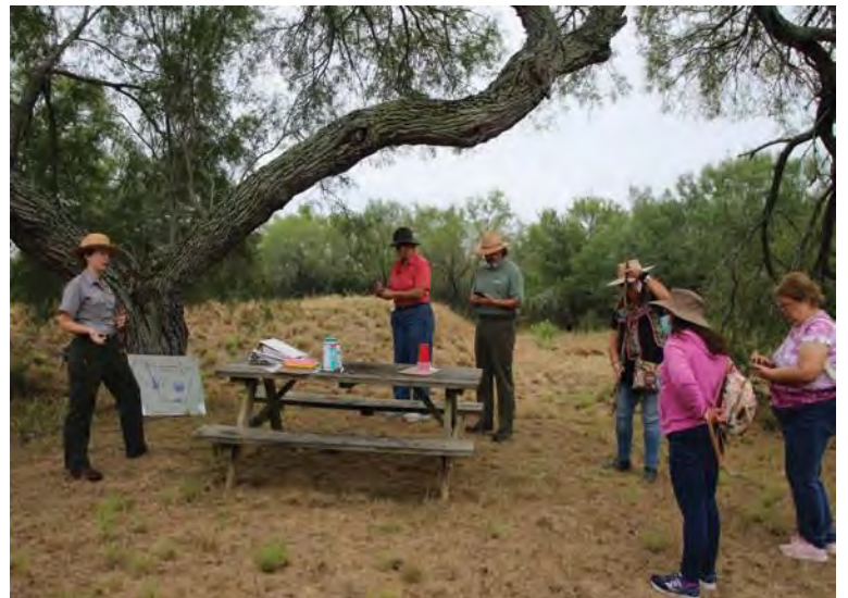
First tour at Rancho de las Cabras.