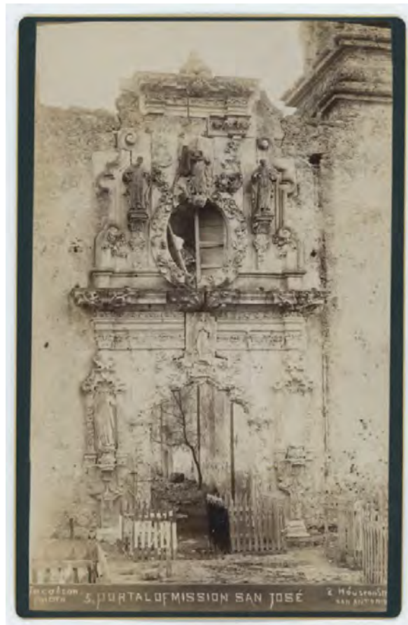
Mission San José c. 1889-1893

University of Texas at San Antonio's Center for Cultural Sustainability and the park conducted a virtual symposium about best management practices for Spanish Colonial stone building preservation management. This was the culmination of 3 earlier hands-on preservation workshops in 2016-2018. Experts in risk management, lime mortars, plaster conservation, water management, and more provided technical papers which were synthesized into a manual to guide park managers through preservation decisions. The Best Practices in Stone Building Preservation Management Manual is available to download through the park's website .