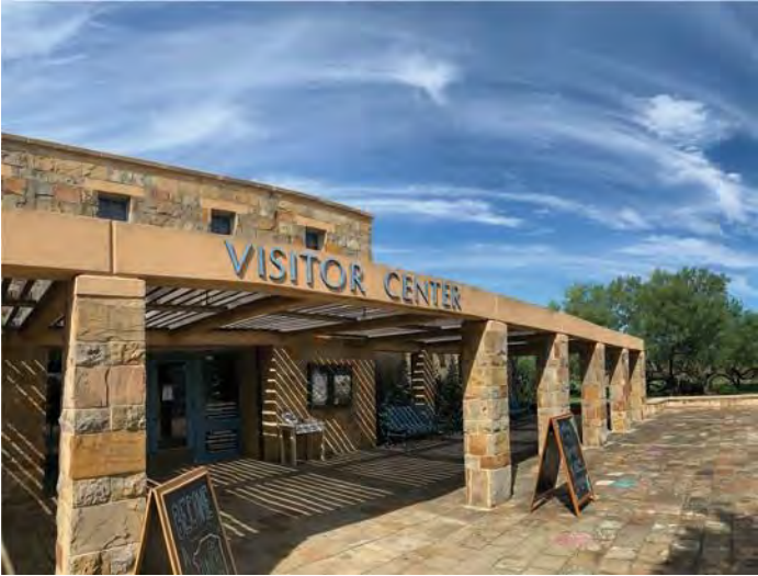
Visitor Center building

The National Park Service made substantial investments in the long term up keep of facilities with both completed and planned projects. In the Visitor Center at Mission San José, HVAC design work is underway, the interior was repainted and deep cleaned in its entirety. The Harris House, which houses Mission Heritage Partners offices, has an exterior envelope rehabilitation design underway and the wood floors were refurbished. At Mission Espada the museum wood floors were also refurbished, and masonry repairs at Mission San Juan continue throughout the year.