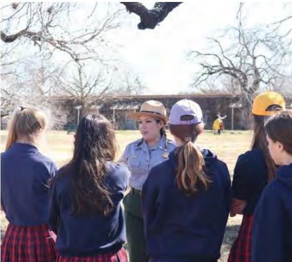
Education ranger on tour