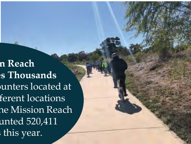
Cyclists on Mission Reach

Mission Reach Reaches Thousands Trail counters located at five different locations along the Mission Reach trail counted 520,411 visitors this year.