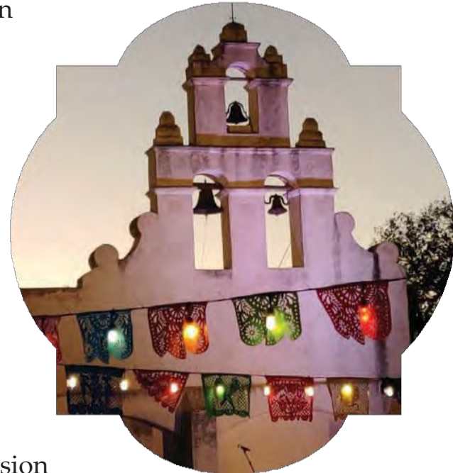
Gala at Mission San Juan

Watch: 2021 #FilmSA Winner – " Maria's Café "