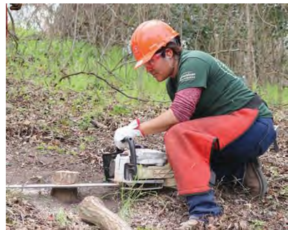
Cultural Landscape Apprentice

National Park Service implemented the Cultural Landscape Apprentice Program to increase operational capacity in grounds maintenance that contributes to visitor enjoyment. This collaboration between the National Park Foundation, National Park Service, Mission Heritage Partners, and American YouthWorks' Texas Conservation Corps, matches local Hispanic/Latino young adults with opportunities to learn about cultural landscape management in a hands-on environment alongside employees at the national park. The program prepares participants for careers in conservation, water management, and environmental planning.