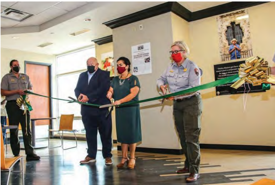
"We're Still Here" ribbon cutting at airport