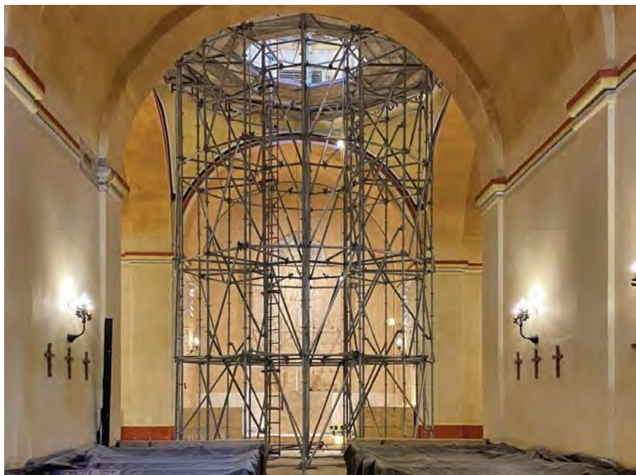
Restoration work at Mission Concepción

Archdiocese of San Antonio , through Las Misiones, performed annual maintenance inspections, preventative maintenance, and routine repairs at the churches of Mission Concepción, San José, San Juan and Espada. This year's preservation efforts were also supported by the biannual Rose Window Gala bringing over 600 people. The gala focused on the immediate repairs of the Mission San José roof and tower. With the support of our generous donors, we will be able to complete the Mission San José repairs in 2022.