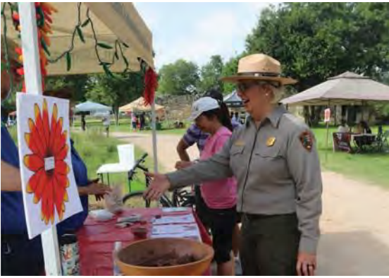
Superintendent at Native Plants event

Mission Marquee Plaza's outdoor markets returned to in-person format monthly from April through September. The program offered the community access to food and nutritional resources, health services, and cultural programming that represented the community's history and traditions. The markets featured demos and other educational resources and fresh food offerings from the San Antonio Food Bank Mobile Mercado, free tree giveaways presented by San Antonio Parks & Recreation, and supported local farmers, artisans, and businesses in the World Heritage Area.