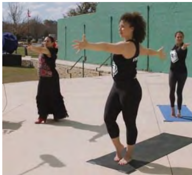
Yoga con Alma