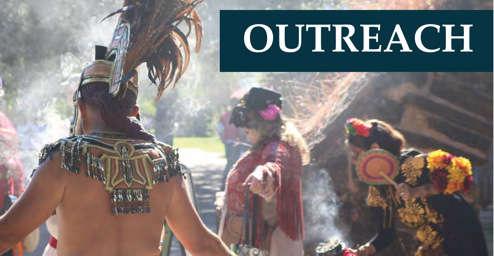
Dancers before Dia de los Muertos event at San Antonio Missions National Historical Park