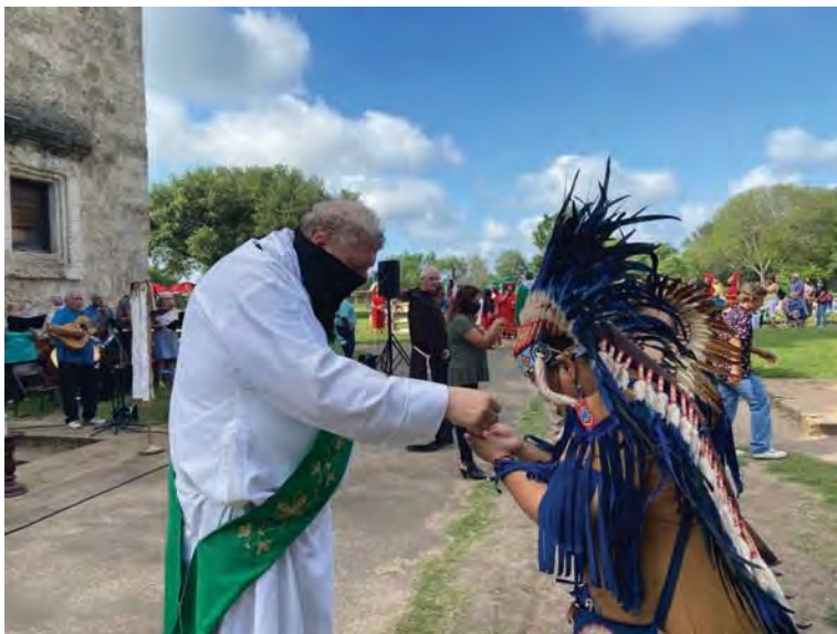
Outdoor Mass at Mission San José