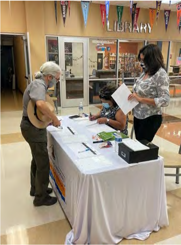
World Heritage Community Meeting