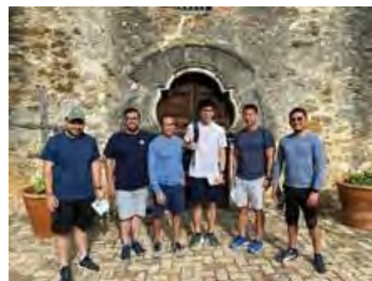
Seminarians at Mission Espada

The El Camino de San Antonio Missions is a ministry of the Archdiocese of San Antonio that encourages and supports pilgrimages to San Antonio Missions. El Camino provides materials for self-guided walks as well as docents that can guide groups through the missions. Despite Covid-19 restrictions, numerous pilgrimage groups walked, biked, and drove to the mission churches.