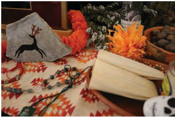
Ofrenda highlighting Native American culture

Plans for Native American Cultural Center Bexar County's most recent commitment is for a Native American Cultural Center located within the buffer zone of the world heritage site. The center will allow for a cultural heritage opportunity with events and activities that highlight the lives of those who lived in and around the missions and provide an opportunity for them to celebrate their cultural traditions.