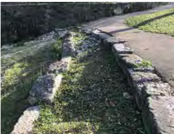
Before Landscape and sidewalk rehabilitation at the Espada Aqueduct

Heritage Site. This work also helped to preserve the historic landscape of the Espada Aqueduct, an important 18th century feature of San Antonio Missions National Historical Park. The project corrected decades of serious erosion and damage to the terraces, and also replacement sections of the walkway to better meet accessibility standards.