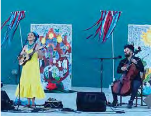
Viva Poesia at Mission Marquee