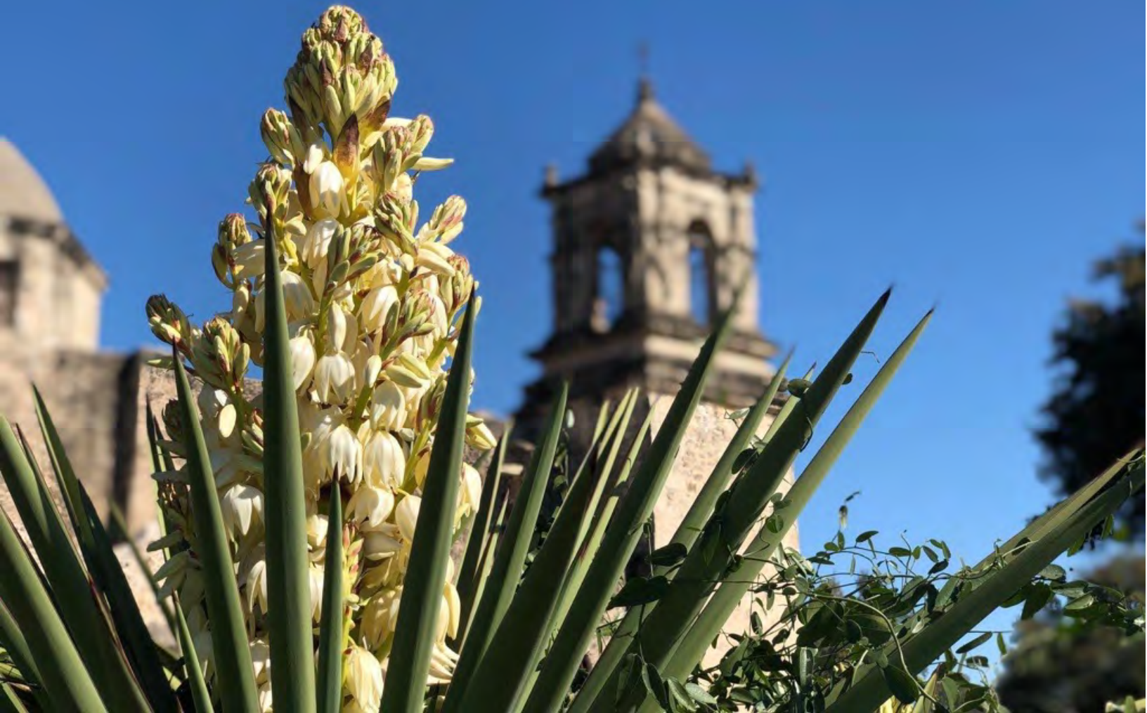
A Spanish Dagger, Yucca gloriosa flowering in front of Mission San José church.