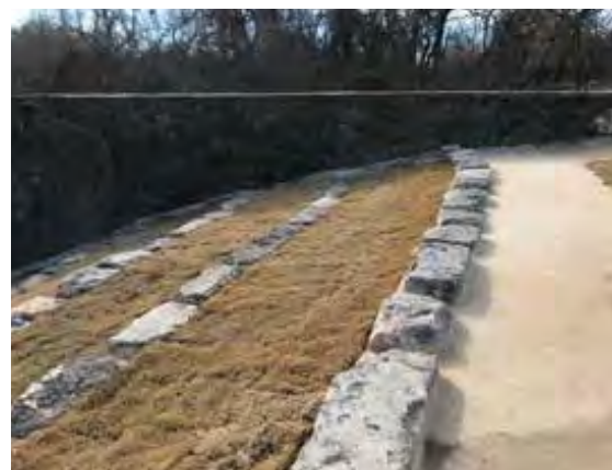
After Landscape and sidewalk rehabilitation at the Espada Aqueduct