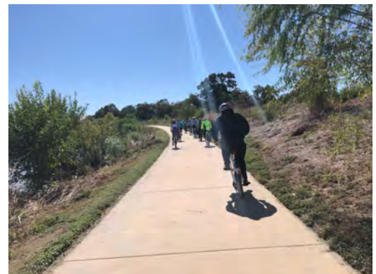
Bicyclists on the San Antonio River Hike & Bike Trail

On December 3, 2020, City Council approved a contract to begin construction on the Mission Road Bond Project along a portion of the World Heritage Trail between S.E. Military Dr. and the San Antonio River. The total project budget is $5.7 million for lighting, pavers, sidewalks, and a multi-use path for safer connectivity between the neighborhoods and the San Antonio River. The project began construction on December 22, 2020. Additional lighting, pavers, and sidewalks will be added to Acequia St. connecting to Espada Rd.