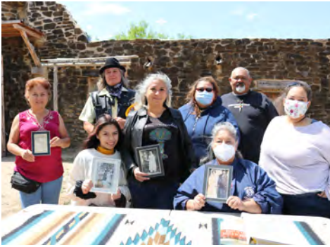
History & Genealogy Day