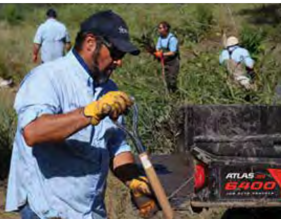
San Antonio River Authority

The World Heritage Office received an invitation to attend and participate on a panel discussion as part of the 2020 Mexico-U.S. Sister Cities Mayor’s Summit held in February in El Paso, Texas. Through the city’s International Relations Office, both the World Heritage Office and Visit San Antonio were invited by summit organizers to participate in a moderated panel discussion on tourism and heritage. The audience for this particular panel discussion was tourism and marketing professionals seeking best practices and perspective