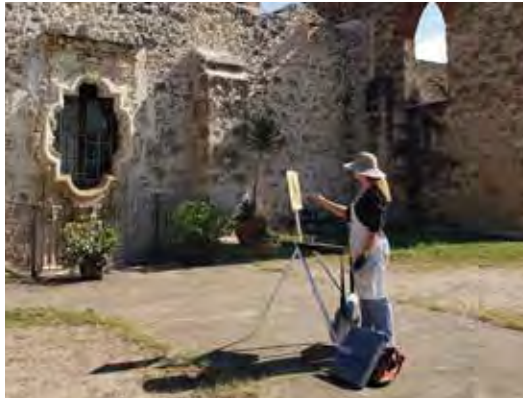
Visitor painting at Mission San José

Data demonstrated a significant increase in trail/park use during the first few months of community-wide business shutdowns due to COVID-19. Trail counters along the Mission Reach registered nearly 124,000 hits in April and May 2020. That equates to over 7,000 more users on the trails each week as compared to this same time in 2019, which is an 83% increase. The overall trail usage increase identified in C1 above is undoubtedly impacted by the usage registered during the pandemic.