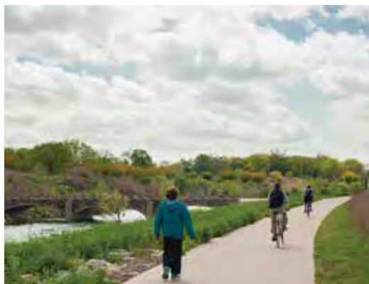
Visitors walking on the San Antonio River Hike & Bike Trail

To celebrate the 10th anniversary of the Friendship City relationship between San Antonio and Suzhou, China, the two cities partnered to present an outdoor photo exhibition on the grounds of Mission San José to promote social distancing. The exhibit was unveiled as part of the 2020 World Heritage Festival in September and remained on display through March 2021 with an online component on the WorldHeritageSA.com visitor website. The exhibit honored the flourishing connections enjoyed by the citizens of the two cities. The Classical Gardens in Suzhou are, like the San Antonio Missions, a UNESCO World Heritage Site. The exhibit was presented by the City of San Antonio, San Antonio Missions National Historical Park, San Antonio Museum of Art and the Municipality of Suzhou.