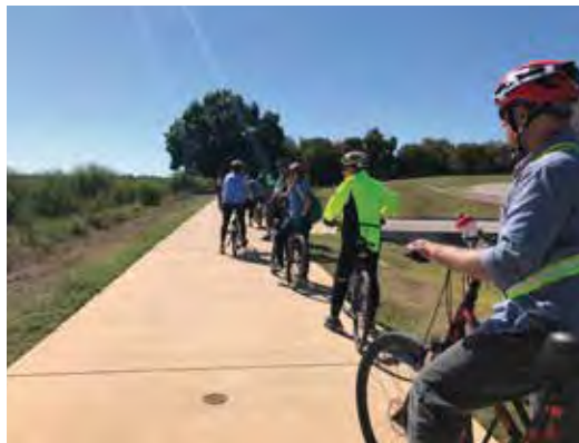
Bicyclists on the San Antonio River Hike & Bike Trail