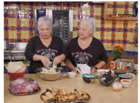
2020 Virtual Tamal Institute

The World Heritage Office and its collaborative partners presented a community project to expand the knowledge on the history and cultural significance of tamales and tamaladas in San Antonio. The virtual program was a UNESCO Creative City of Gastronomy initiative that took place as a series over three months from October through December. Two pre-recorded cooking demos and three video tutorials taught participants how to prepare tamales, while a virtual panel discussion shared the historic and cultural significance of tamales. The event also included participation by four UNESCO Creative Cities of Gastronomy: Ensenada, Merida, Portoviejo and Belo Horizonte. Each program in the series was shown on YouTube and Facebook.