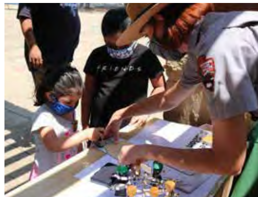
Junior Ranger Program

The World Heritage Office hosted the 2020 World Heritage Open House live on Facebook and YouTube June 22-24, 2020. The annual Open House was held as a virtual event in response to the pandemic and to keep residents safe and socially distanced. City staff and World Heritage partners provided information on services and response programs, as well as updates on bond and public art projects, and resources available to the community. The design of the new World Heritage Center was also announced.