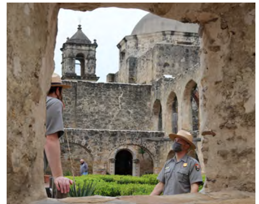
Park Rangers at Mission San José

The San Antonio Archdiocese has promoted a variety of events through mainstream and social media increasing the visibility of the mission churches. Sacred Sanctuary programs were taped at each mission church and shown on Catholic Television and other media outlets. Restrictions due to the pandemic were instituted in April resulting in fewer religious services. However, the masses at Missions San José, San Juan, and Espada were conducted outdoors increasing the visibility of the services. Likewise funerals and weddings continued to occur but outdoors. The Archdiocese sponsored a Care of Creation Outdoor Mass and tree giveaway with appropriate safety precautions in September 2020 as part of the World Heritage Festival. The individual mission churches developed new traditions as they conducted seasonal services outdoors and with safety precautions.