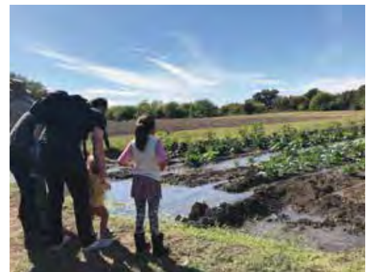
Farm at Mission San Juan

The City of San Antonio's Economic Development, World Heritage Office and South Side First, through a solicitation process in the Fall of 2020 and jointly funded by EDD and WHO, identified a consultant, EPS and MIG, to develop a strategic plan to encourage and attract investment for the southside opportunity zones, Specifically the Mission San José/Brooks area, a historically low-income area. The goal of the strategy is to identify investments that are in alignment with community priorities and sensitive to the existing residents and small business community. The report will be finalized in 2021.