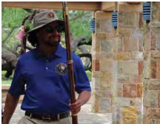
Volunteer at Mission San José