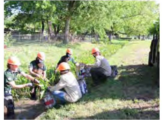
Texas Conservation Corps working at the Espada Acequia

As part of building renovation behind Mission Concepcion, trenching was conducted and a main part of the Mission Concepcion Acequia was discovered and a small number of artifacts collected by the UTSA archeology team.