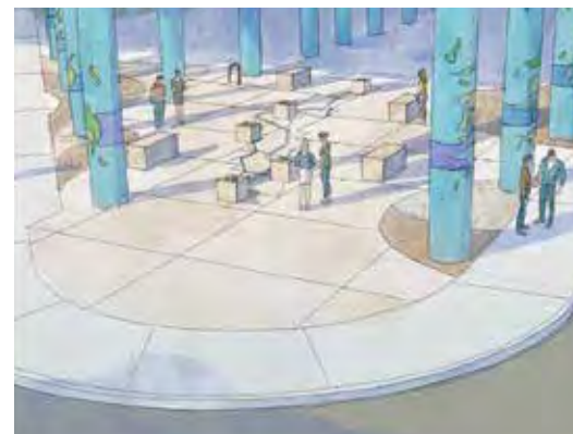
AARP Community Challenge Grant

In summer 2020, the World Heritage Office was selected as an AARP 2020 Community Challenge Grant recipient for a component of the U.S. Highway 90 Underpass Beautification Project. The “quick action” project is located below the U.S. Highway 90 Underpass at Mission Road and Steves Avenue in the World Heritage Area. This project will include a design enhancement and bench seating that complements the “Windows to Our Heritage” World Heritage public art project, as well as to help activate a new public space and beautify the underpass. The City is also making infrastructure investments to this underpass location, as well as S. Presa Street and Roosevelt Avenue that includes sidewalks, hardscape, and landscaping.