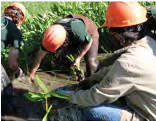
Texas Conservation Corps at the World Heritage Site