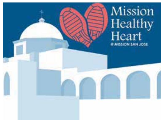
Mission Healthy Heart Walk

In April 2020, San Antonio Missions National Historical Park offered several virtual public programs for National Park Week. Over the course of the week, the park offered a live story-time, performance of America the Beautiful, art workshops, and an interactive poetry workshop. All programs were free.