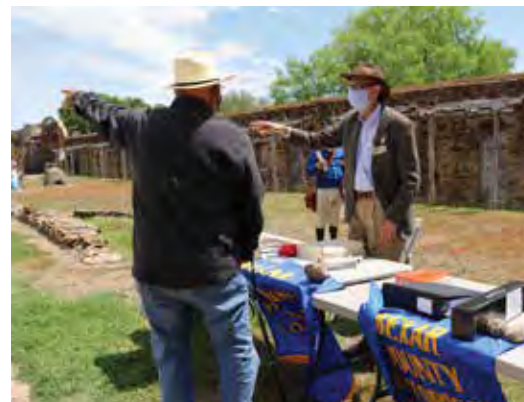
History & Genealogy Day

The World Heritage Ambassador Program is managed by the City of San Antonio World Heritage Office and is a collaborative effort with Visit San Antonio and its Certified Tourism Ambassador (CTA) program. The program is part of the World Heritage Work Plan to better engage San Antonio residents with visitors and provide a unique and enhanced experience when visiting the city. For 2020, the World Heritage Office updated the online course with a new module on San Antonio's UNESCO Creative City of Gastronomy designation. The new module gives an overview of the Creative Cities designation and how it intersects with the World Heritage Site designation. For 2020, there were 203 registered World Heritage Ambassadors.