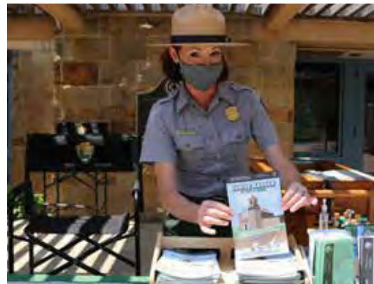
Junior Ranger Program

The World Heritage Office held a modified Drive-Thru Farmers and Artisans Markets on the third Saturday of the month from October to December 2020. The markets offered local residents much-needed access to food and nutritional resources, health services and cultural programming that represent the community’s history and traditions. The program supported local farmers, artisans, and businesses in the World Heritage Area that have been impacted during the ongoing pandemic. The markets included a tree adoption, “Prescription for Produce” program, informational resources related to health services, a thermometer give-away for the community, and senior citizen food vouchers redemption. Attendees pre-ordered artisan vendor products online and picked up on market day for cashless transactions.