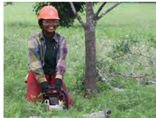
Texas Conservation Corps at the World Heritage Site