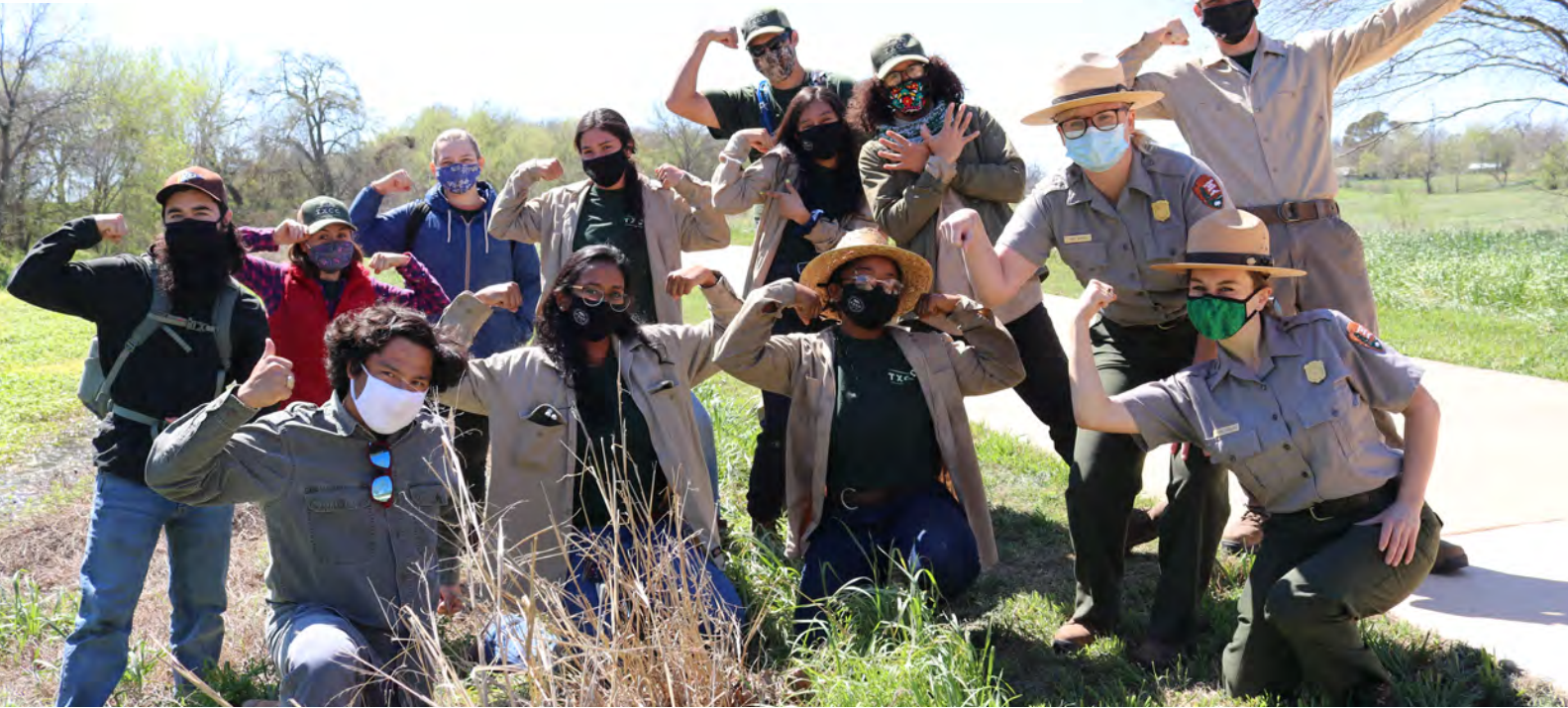
Service members with the Texas Conservation Corps pose with Park Rangers at the San Antonio River Hike & Bike Trail.