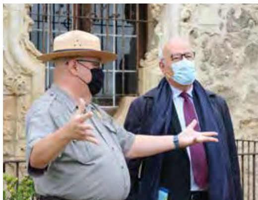
Park Ranger at Mission San José