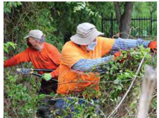
SALSA Squad clearing brush from the Espada Acequia

In 2020, the National Park Service and partners repaired a section of the San Juan Acequia. Project funding was sourced through the National Park Service, San Antonio River Authority, along with additional stabilization efforts. The project reduced loss of water along San Juan Acequia and provided water to farm fields located downstream.