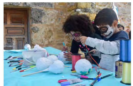
Kids at Dia de los Muertos at Mission San José

Events which engaged diverse youth and youth groups in 2020 included: Outside for All (1/18/20), a walk/run/bike from Roosevelt Park along the Mission Reach with a panel discussion on how all segments of our community connect to parks, trails, and natural areas; Bloom Project, a kayaking and bird watching program along the San Antonio River's Mission Reach; Twin Cities Field Trips (March/April 2020) a kayaking, biking, bird watching, and ecosystem education program; Rancho Days (March 2020) a partnership hosting one Wilson County school's 5th grade for a field trip to Rancho de las Cabras; and Teacher Training (February 2020)– a birding skills and ecosystems 101 workshop with Project ACORN.