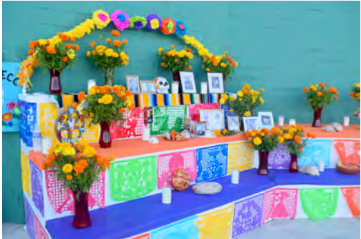
Mission Marquee Plaza Dia de los Muertos Celebration

The 5th Annual World Heritage Festival was held September 8-13, 2020 and commemorated the 300th anniversary of Mission San José. The World Heritage Festival is an annual collaborative event organized by the World Heritage Office and its partners to celebrate and promote the San Antonio Missions and raise funds to preserve, promote, and connect. For the safety and wellbeing of the community during the pandemic, many World Heritage Festival events transitioned to virtual events with online components or remained as outdoor events for social distancing.