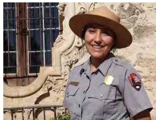
Coffee Chat with a Ranger

Throughout 2020, San Antonio Missions National Historical Park offered a Facebook virtual series every first Friday of the month to answer frequently asked questions. Participants learned about the park and chatted live with a Park Ranger from the comfort of their home. Monthly topics included park activities, outdoor recreation opportunities, upcoming events, and park FAQs from our direct messages.