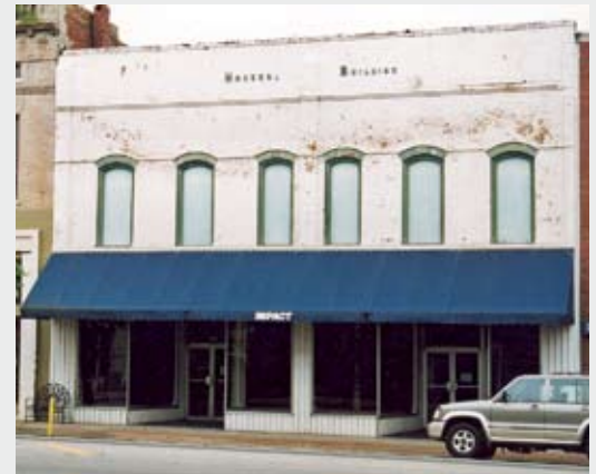
The photograph above shows the building described in the sample application prior to the rehabilitation work. Below left, the building is shown after its successful rehabilitation.