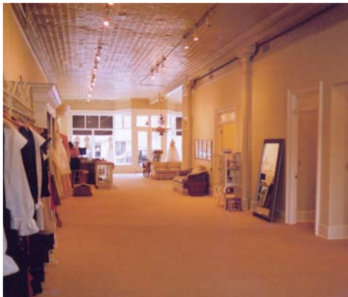
Retaining historic character: The historic tin ceiling was retained during the rehabilitation for this Main Street clothing store.

For example, Mr. Dillon has owned a downtown building for a number of years. He originally purchased the property for $150,000, and of that purchase price $40,000 was attributed to the cost of the land. Over the years, Mr. Dillon has depreciated the building for tax purposes by a total of $60,000. He recently replaced the roof at a cost of $8000. Mr. Dillon’s adjusted basis would be $58,000. Since he intends to spend $60,000 to fix a leaking basement wall; upgrade the heating/air conditioning systems; and repair the deteriorated storefront, the rehabilitation would qualify as a substantial project. If he completes the application process and receives approval, Mr. Dillon will be eligible for a 20% credit on the cost of his rehabilitation, or a $12,000 credit.