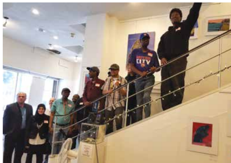
The artists from the Services to Enhance Potential (STEP) exhibit at the Peace Gallery in Detroit.

Services to Enhance Potential of Westland: Supported a month-long exhibit of art pieces created by young people with disabilities at Detroit's Peace Gallery to celebrate Michigan's rich automotive history.