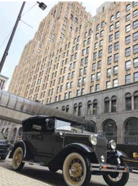
A Ford Model A used by Antique Touring Company, one of MotorCities new partners, to provide their unique auto heritage tour experience, entitled "From Tinkers to Titans in the Auto Age."

MotorCities partnered with seven metro Detroit tour operators to offer a series of auto-themed historical tours. The experiences included tours in a Ford Model A, on a bicycle, on a bus, and on a kayak in the Detroit River, along with standard walking tours. Collectively, the tours reached more than 400 people in its inaugural season.