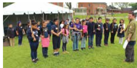
Students learn about how U.S. Army soldiers trained at Historic Fort Wayne during Every Kid Outdoors week in May.

MotorCities joined the Detroit Parks and Recreation Department, Detroit Public Schools Community District, the Historic Fort Wayne Coalition and more than 20 other partners to present the fourth annual Every Kid Outdoors program at Historic Fort Wayne in southwest Detroit in May. More than 1,000 fourth graders participated in the program.