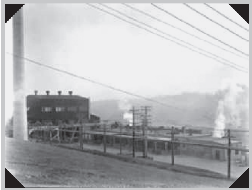
X-10 reactor building in Oak Ridge, Tennessee

The National Park Service has been directed by Congress to conduct a special resource study for four of the Manhattan Project sites. The study will include evaluation of the significance of the sites as well as evaluations of the suitability and feasibility of designating one or more sites as units of the National Park System. As part of the study a range of alternatives will be developed which