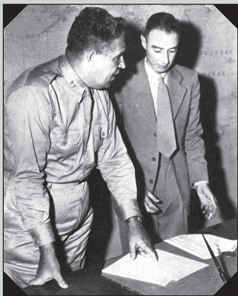
General Groves and Robert Oppenheimer