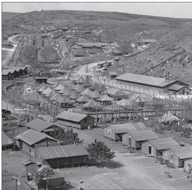
Honouliuli Internment Camp, R.H. Lodge photograph, courtesy of Hawai'i's Plantation Village.