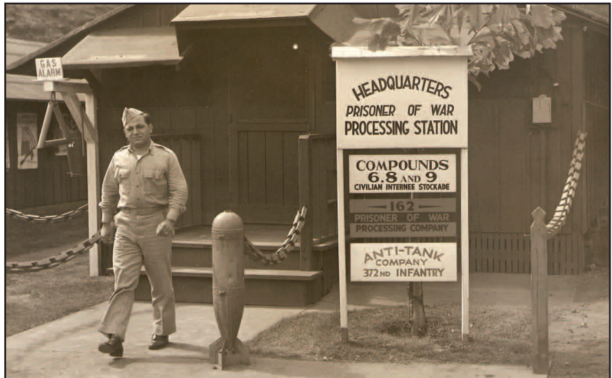
Honouliuli Internment Camp