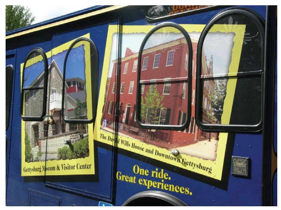
Park visitors and members of the community can now ride trolleys and buses on all three Freedom Transit lines are now free, thanks to funding from the Gettysburg Foundation.

Freedom Transit provides public transportation on three routes serving the Gettysburg area: the Blue line, the Gray line and the Lincoln line. All lines connect residents and visitors to major destinations throughout the community. Schedules are available at the website: ridethetrolley. com or by calling 1-800-632-9063. The service is a collaborative effort of the Borough of Gettysburg, Gettysburg College, Gettysburg Convention and Visitors Bureau, Gettysburg Foundation, Gettysburg National Military Park, Main Street Gettysburg, Penn DOT and York Adams Transportation Authority.