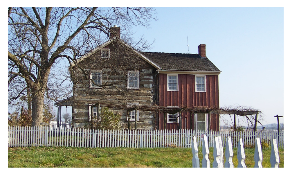
The Klingel House, along Emmitsburg Road, will benefit from Recovery Act funds.

On July 2, men of Carr's Union brigade fortified themselves within the house during Confederate attacks, knocking out the chinking in the exposed log walls in order to fire against enemy infantry. On July 3, the building was used to shield and screen Confederate artillery in the