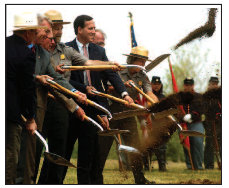
A celebratory groundbreaking took place in June 2005.

Phase one of the construction was the restoration of historic Guinn Run, a stream that runs through the