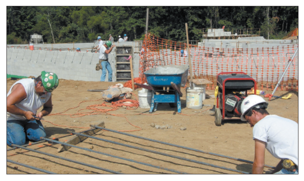
A hive of activity at the construction site for the park's new museum.

Heavy equipment continues to roll at the site of the park's new museum and visitor center. Already walls are starting to rise up from the huge hole in the ground where the building will be. In another month, contractors will be putting up the structural steel for the 139,000 square foot structure.