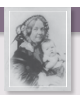
Elizabeth Cady Stanton and her daughter, Harriot, 1856.

• Rooted in both the example and the course set by 19th century reformers in Seneca Falls, New York, the women's movement evolves and inspires passion and commitment from succeeding generations who continue to fight for the rights of all people.