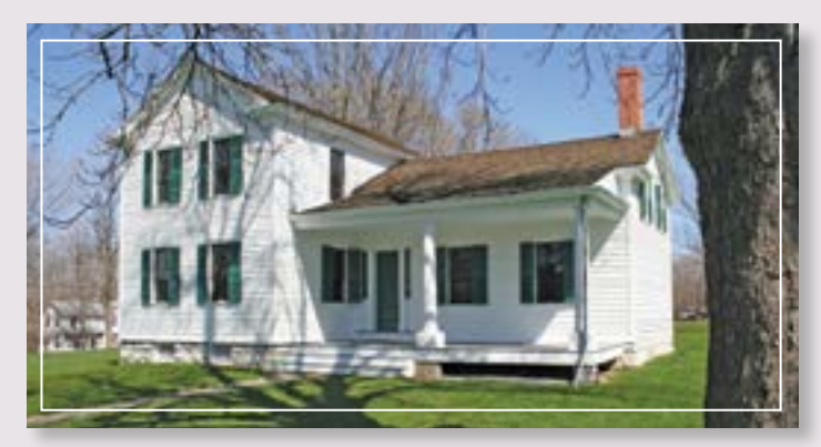
The Seneca Falls home of Elizabeth Cady Stanton and her growing family from 1847 to 1862. During that time Stanton helped organize the first women's rights convention in 1848 and launched the reform movement for women's rights.

Women's Rights National Historical Park was established by the U.S. Congress in December 1980. It was listed in the National Register of Historic Places on December 28, 1980. The Women's Rights National Historical Park District comprises four noncontiguous units that are thematically linked to the early 19th century Women's Rights Movement in the United States and to the first Women's Rights Convention, held in Seneca Falls, New York, in 1848. The four units are the Wesleyan Chapel and Declaration Park, the Elizabeth Cady Stanton House in Seneca Falls, and the M'Clintock House and the Hunt House located nearby in Waterloo, New York. The park's visitor center is located in Seneca Falls. The park boundary encompasses a total area of 7.44 acres. The park's maintenance facility, located on Water Street in Seneca Falls, is leased by the park and not owned.