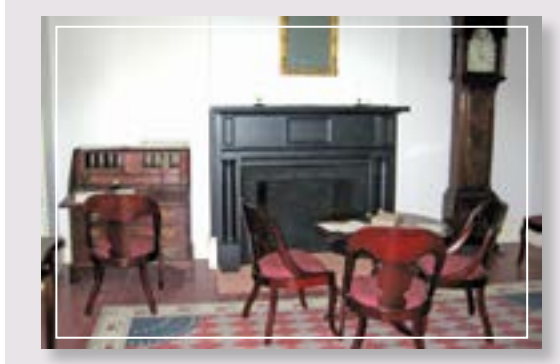
The M'Clintock House parlor showing a replica of the table where the Declaration of Sentiments was drafted.

The Declaration of Sentiments, unanimously adopted at the 1848 convention, is a document of enduring relevance, which asserted that equality and justice should be extended to all people without regard to sex.