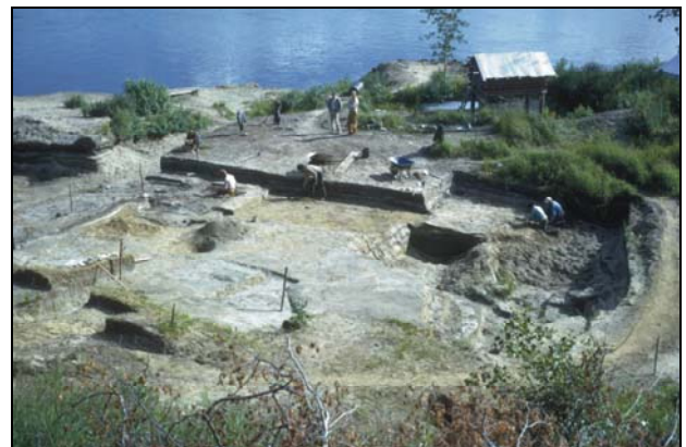
An archeological excavation at Onion Portage.