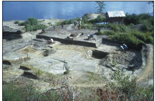
An archeological excavation at Onion Portage.