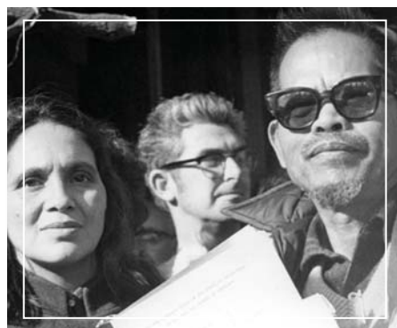
Dolores Huerta and Larry Itliong, c. 1970s.