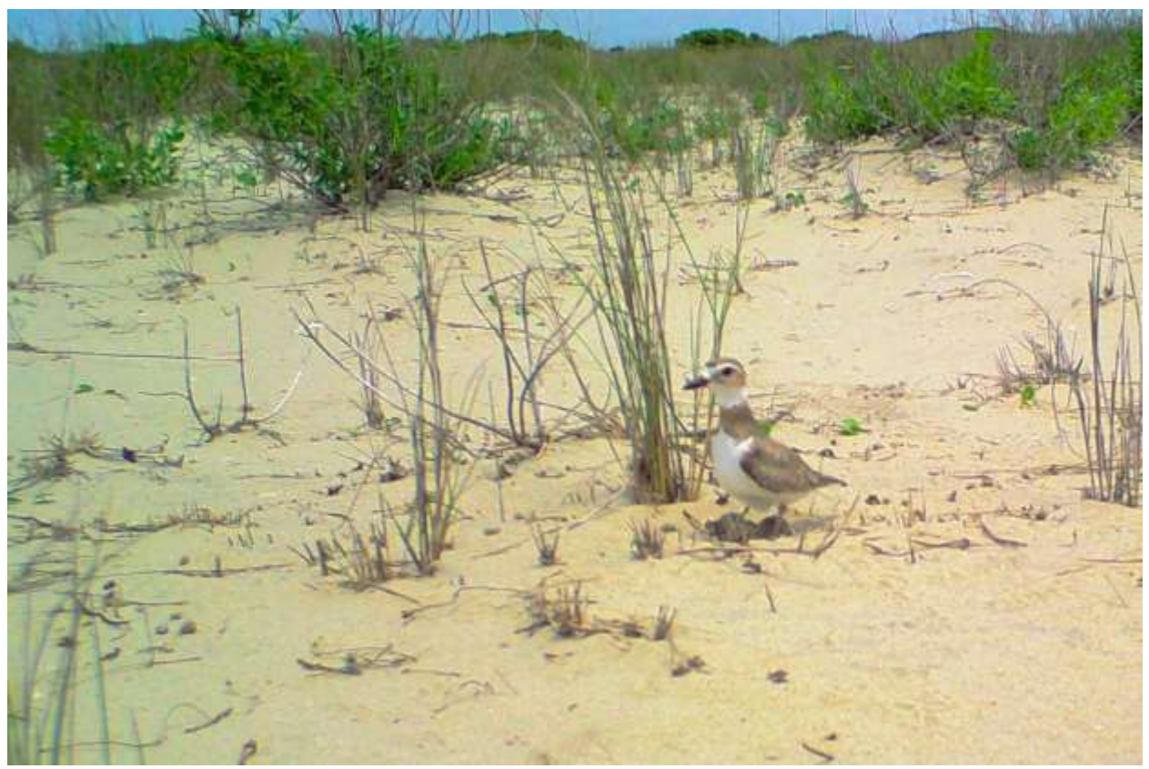
Wilson's plover shading eggs on Ocracoke Island.

National Park Service 1401 National Park Dr. Manteo, NC 27954