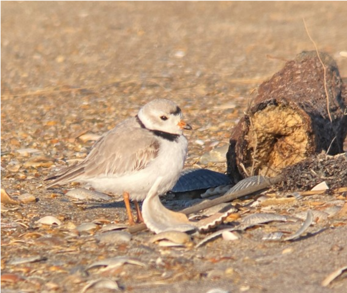
Adult piping plover back on its historical nesting grounds, west of Cape Point.