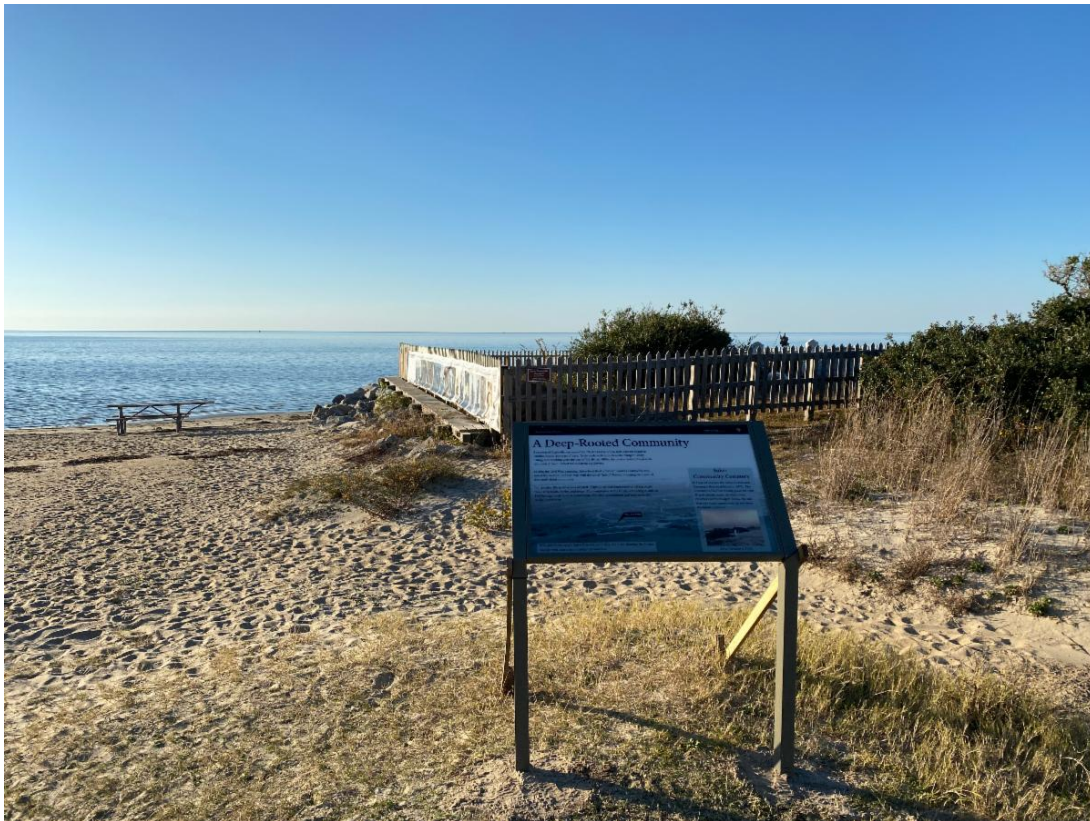
Cape Hatteras National Seashore staff recently installed a Salvo Community Cemetery educational panel at Salvo Sound Access.