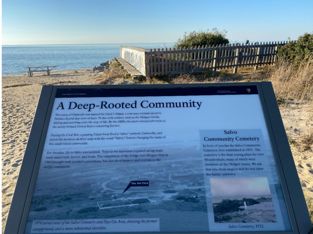
Closer look at the Salvo Community Cemetery educational panel.