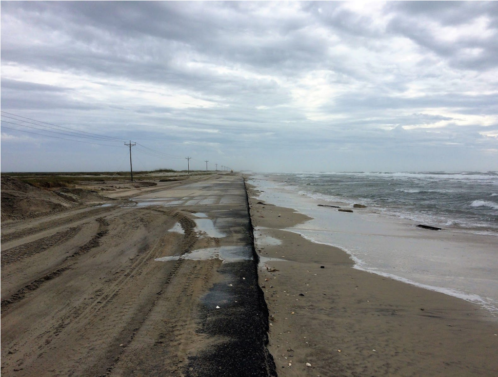
Post-storm view of NC-12 on Ocracoke Island after Hurricane Florence. NC Department of Transportation and National Park Service heavy equipment operators are actively working to rebuild the dunes and clean up the area.