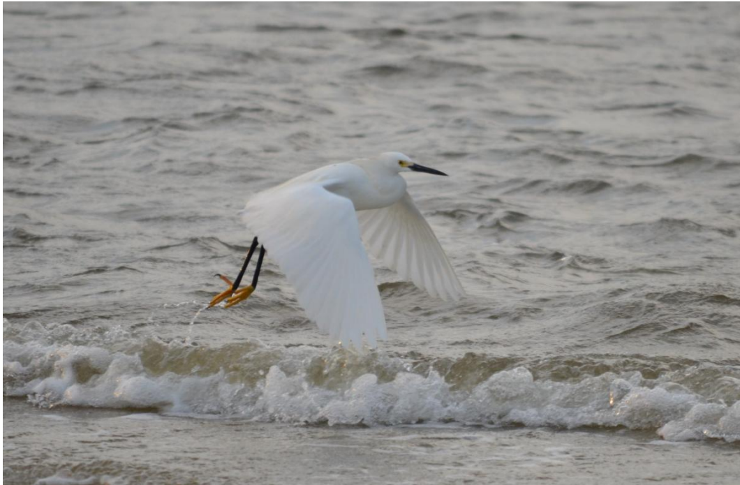
A snowy egret erupts in flight near Oregon Inlet.