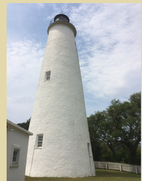
Ocracoke Lighthouse History