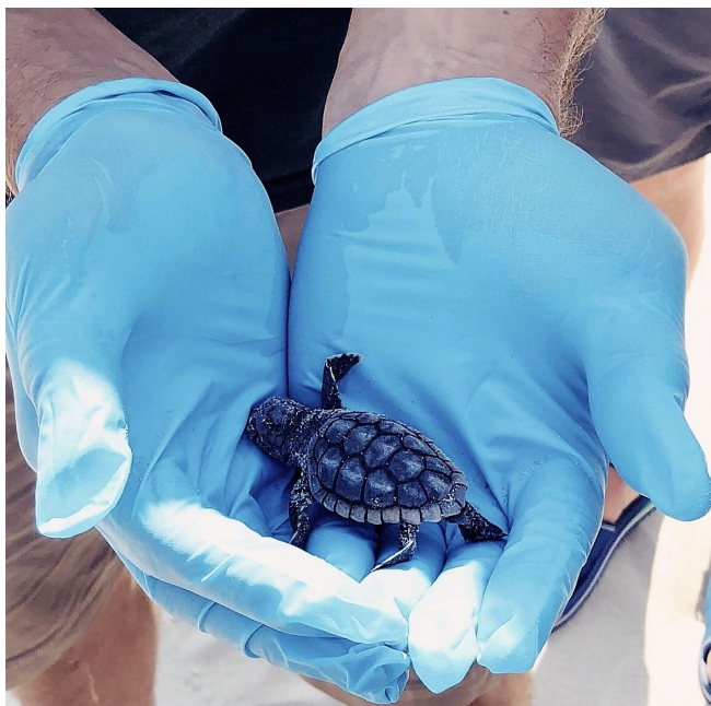
Baby Loggerhead sea turtle found during recent Ocracoke nest excavation.