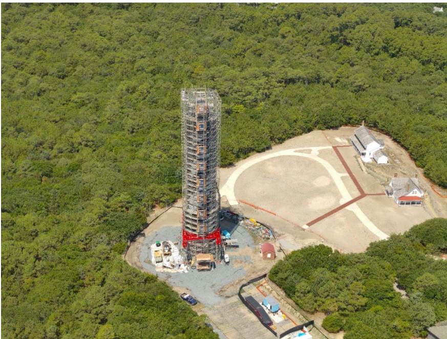
Photos taken during the multi-year Cape Hatteras Lighthouse restoration project can be found on Cape Hatteras National Seashore's Flickr page .