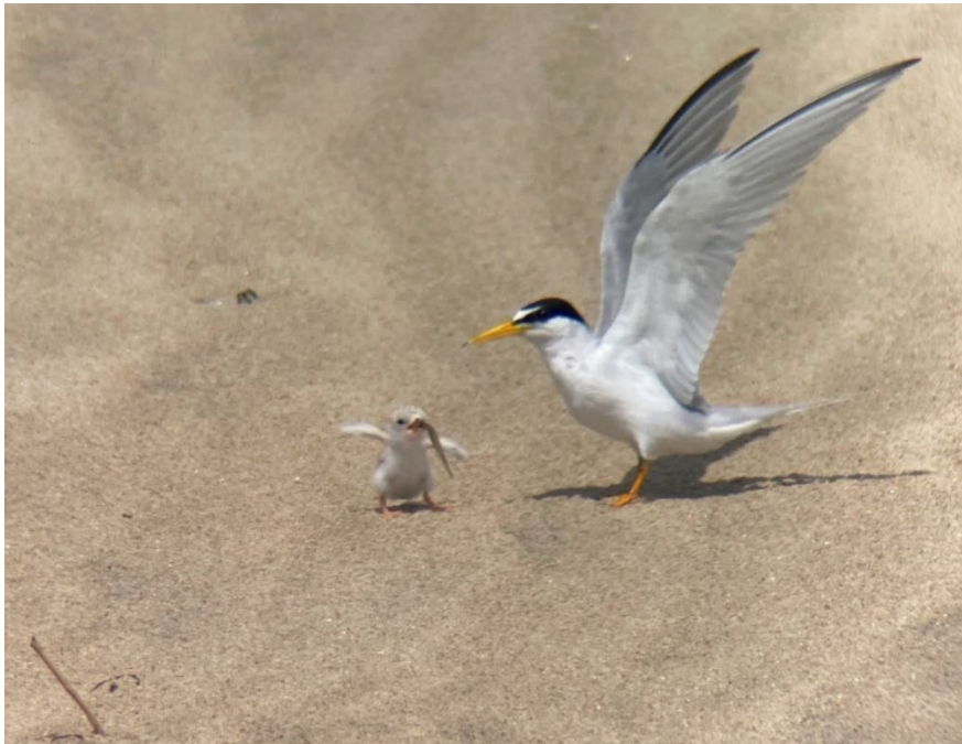
An adult least tern gives its chick a tasty minnow.