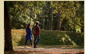
Fort Raleigh National Historic Site