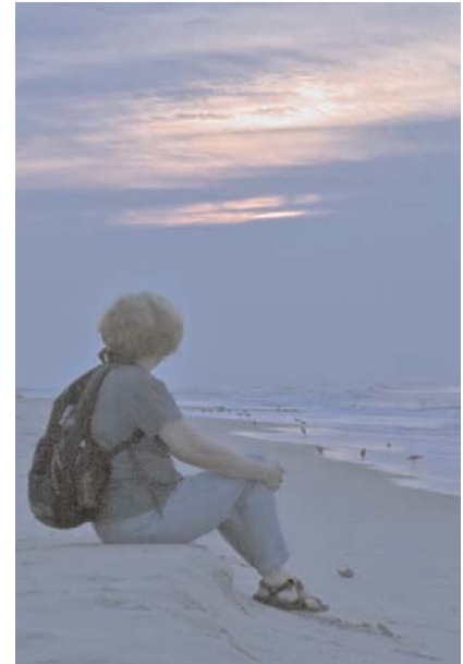
Visitor experience goals at the Seashore range from organizing special programs that draw large crowds to opportunities for individuals to find solitude.