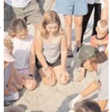
A park ranger interpreting a sea turtle nest on the beach helps visitors make intellectual and emotional connections to the park's resources.

As stated previously, this is not an all-inclusive list, and should be updated as necessary. NPS rangers/interpreters, park partners, and media specialists should use this list and the interpretive theme statements on the next pages as a starting point when developing personal services, education programs, and interpretive media.