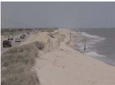
Some sections of NC Highway 12 have been moved westward because of shoreline migration.

Barrier islands, such as those comprising the Seashore, are by nature dynamic, and in a state of constant change through daily tide fluctuations, annual storm and hurricane impacts, and long term coastal erosion and sea level rise. Pre-storm preparations and post-storm recovery can have significant impact on park and regional operations.