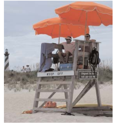
Some of the Seashore's beaches have lifeguards during the summer, but most of the beaches have no lifeguards year-round.

Currently there is very little formal interpretive training for the park's permanent interpretive staff. Training for seasonal staff is challenging because the start dates of the Seashore's seasonal staff are staggered, depending on district needs. Hatteras Island seasonals start the earliest and generally attend a thorough two-week training course; some park partners may participate in this training by providing sessions such as lighthouse history from members of the Outer Banks Lighthouse Society. Bodie Island and Ocracoke Island seasonals start later in the season and