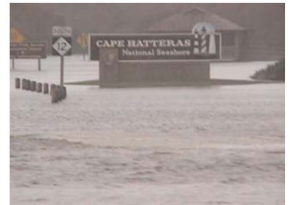
Major storms strike Cape Hatteras regularly and cause great changes in the Seashore's barrier island resources.