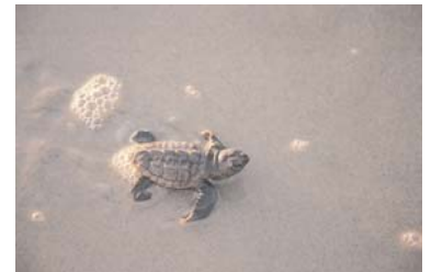
Sea turtles and other Federally protected species breed and nest on the Seashore's beaches.

Federally-listed threatened and endangered species in the park include Piping Plover (all year), breeding sea turtles (loggerhead, green, leatherback), and sea-beach amaranth. State listed species that nest on park beaches include the Common, Least, and Gull-billed terns, Black skimmer, Wilson's Plover and American Oystercatcher. These protected species are impacted by human disturbance and loss of suitable habitat because of human recreational activities and predation.