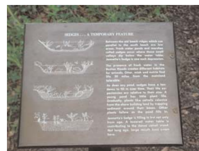
Most of the Seashore's wayside exhibits are the anodized aluminum type that were produced in the 1970s.