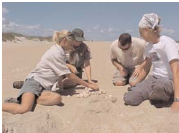
The future interpretive programs offered at the Seashore will emphasize preservation and stewardship, such as programs about sea turtles nesting.