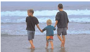
Walking in the Seashore's surf and other recreational activities provide park visitors with relaxation and memorable experiences.

The Seashore provides outstanding opportunities for relaxation, recreation, reflection, and memorable experiences for people across all generations and walks of life.