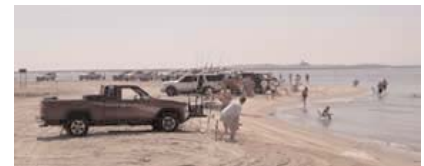
Anglers and other visitors use of Off-Road Vehicles (ORVs) at the Seashore is permitted year-round, but with limitations.

Most visitors associate anyone in an NPS uniform as a person who knows the park. In many cases, maintenance, law enforcement and resources management personnel are the first contact for visitors. A well-informed park staff can orient visitors and answer their immediate questions or direct them to an appropriate location to find the answers. Interpretive training can provide the tools that employees