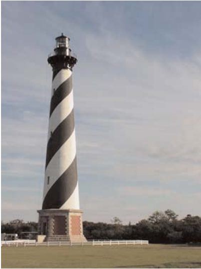
New visitor facilities were constructed after the Cape Hatteras Lighthouse was moved from its original location in 2000.

About 50 miles south of the Seashore's north entrance is the Hatteras Island Visitor Center. This visitor center is within a small group of modern and historic structures located around the Cape Hatteras Lighthouse. The interpretive space in the visitor center consists of two large bulletin boards and a small information desk. Behind the desk is a small office and storage closet. Most of the rest of this building's floor space contains EN sales dis-