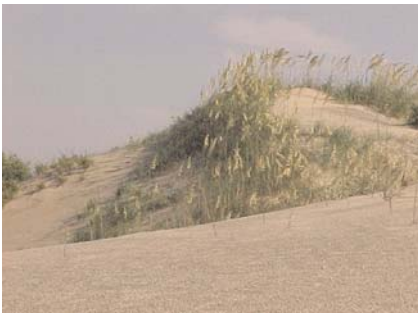
The beaches at Cape Hatteras National Seashore are part of the barrier island ecosystem - one of the most dynamic landforms in the world.