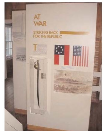
The Museum of the Sea exhibits at Hatteras Island were planned and built for another building, but were retrofitted for the Double Keepers Quarters.

This exhibit area is within a structure built in 1979 and has 600 sq. ft., although the actual exhibit space is difficult to measure separately since it is significantly mixed among a large number of EN sales displays. The exhibits are mostly wall-mounted panels with large routed-wood titles over each. Topics/titles include: Ocracoke discovery, Outer Banks orientation, early tourism, changing Ocracoke, Ocracoke horses, World War II, Life Saving Stations, Ocracoke Lighthouse, Blackbeard and pirates, seashells, birds (which are labeled and mounted in the ceiling rafters), and an events board with the park’s current events and interpretive schedules.