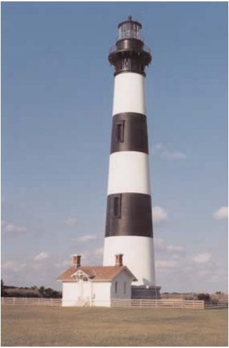
Bodie Island Lighthouse has been closed to visitors since 2004 when iron pieces fell from the metal collar near its top.

The lack of adequate information/orientation facilities at the main entrances to the park compounds the ability of NPS staff to provide adequate orientation to park visitors. Many park visitors never encounter NPS staff and thereby are not being given the opportunity to understand, or be made aware of, park rules and regulations and the value of protecting the park's natural and cultural resources. Much of the violations occurring in the park are due to visitor ignorance of park rules and regulations, and ignorance of the importance of resource protection. Given the current lack of adequate orientation facilities, the park needs to look at alternate methods.