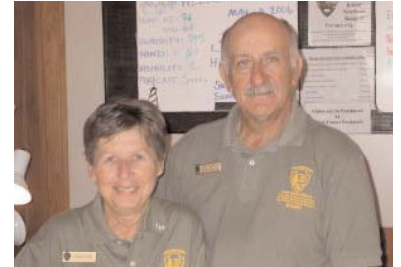
Volunteers support many of the park's interpretive operations from March through November each year.

Volunteers support interpretive operations, improve interpretive materials, and produce additional research as well as allow paid staff the time to seek additional opportunities for training and career advancement. Prospective volunteers are recruited through the NPS volunteer website, word of mouth, and outside publications geared toward workampers. The Seashore maintains a volunteer website ( www.nps.gov/caha/volunteer.htm ) which provides general information on the volunteer program. Generally, most volunteer work occurs from March through November. With additional resources and funding, the park could recruit more volunteers with recreational vehicles for some districts. Local volunteers are recruited through partner organizations, local publications, local posting locations (bulletin boards in grocery stores, post office), and schools. A Volunteer Needs Assessment needs to be completed to determine the volunteer needs Group-wide by division to include type of volunteers needed, number of volunteers, dates of volunteer service needed, etc. Once completed, this assessment will serve as a volunteer targeted recruiting tool for the Group.