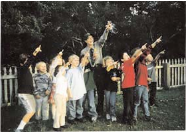
The Seashore's interpretive programs are scheduled for a variety of themes, interests, and age levels, including education programs geared for children.

“Especially for Kids” (45 minutes): hands-on, fun activities for kids while learning about the Seashore. Program is offered Thursdays at 4:00 p.m. and Saturdays at 3:00 p.m.