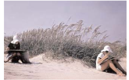
Visitors sketching on the beach enjoy a recreational activity that is compatible with the park's primary purpose of preserving the park's resources.