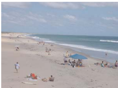
Visitors to the Seashore's beaches need safety information on sunburn, heat issues, rip currents, jellyfish, underwater objects and weather conditions.

The majority of employee injuries at the Seashore involve insect bites (ticks, spiders), back injuries from lifting, and "struck-by" injuries (falling items).