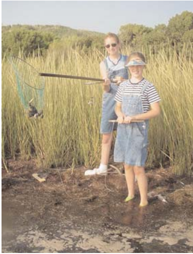
Future curriculum-based education programs may be coordinated with the Seashore's many partners.