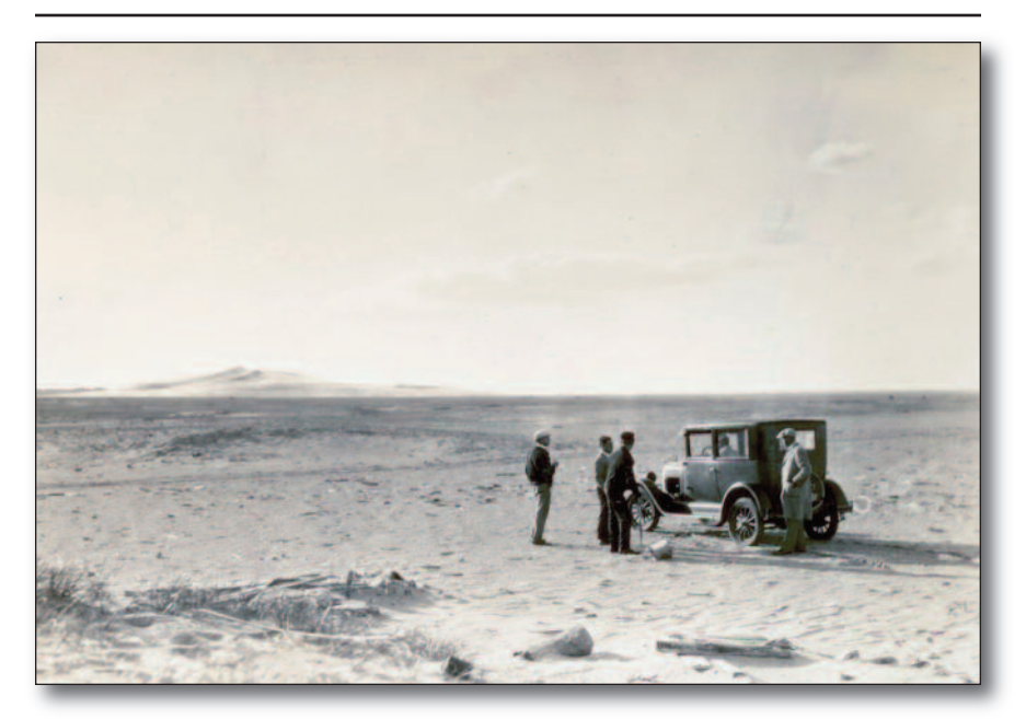
Figure 1 . Visitors stop near windswept Kill Devil Hill, where the Wright Brothers made their historic flight. Approximate date early 1930s.