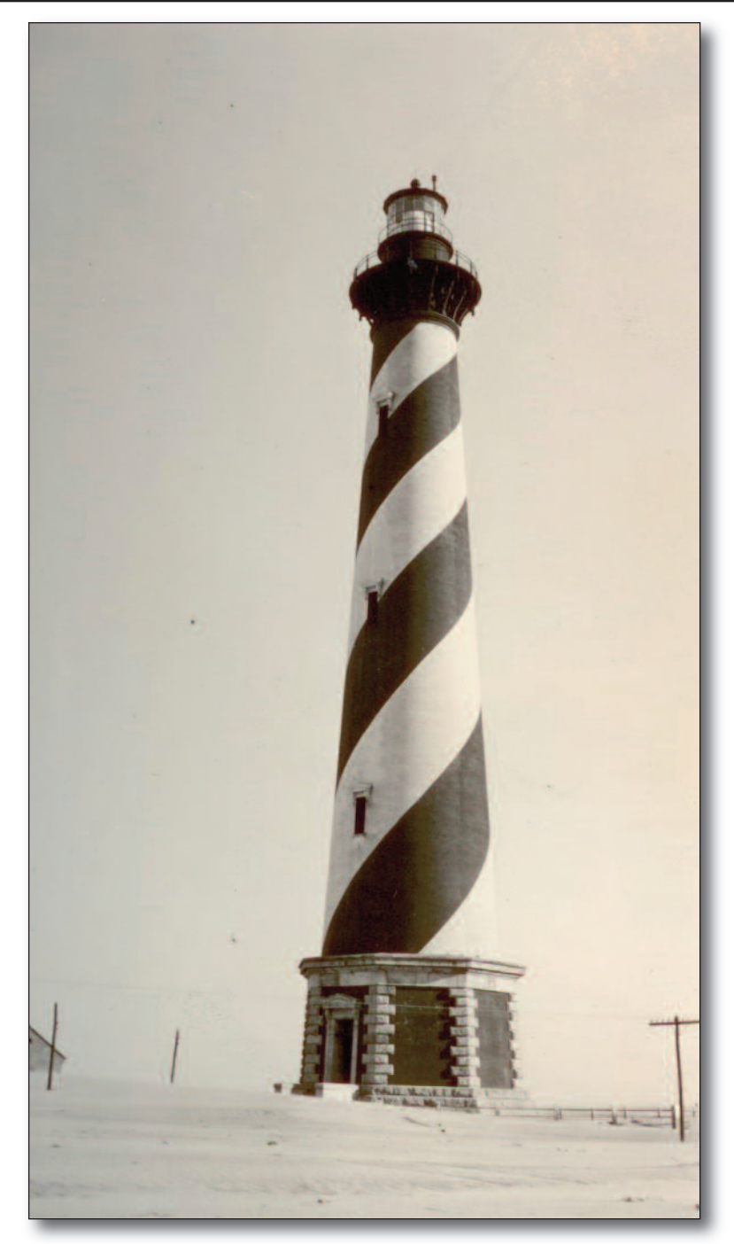
Figure 3. The Cape Hatteras Lighthouse in its original location. The lighthouse was moved 1,600 feet in 1999 to protect it from an eroding shoreline. Date unknown.