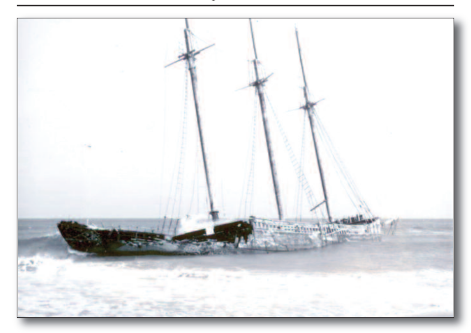
Figure 4. This lumber schooner washed ashore on Ocracoke Island was one of more than 600 ships wrecked in the treacherous waters along the Outer Banks of North Carolina. Date unknown.