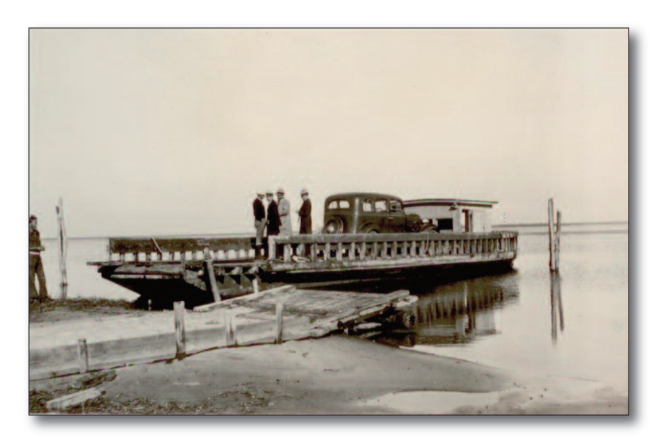
Figure 2 . Early visitors to Cape Hatteras National Seashore had to rely on ferries like this one at Oregon Inlet, which separated Bodie and Hatteras islands. Approximate date 1934.