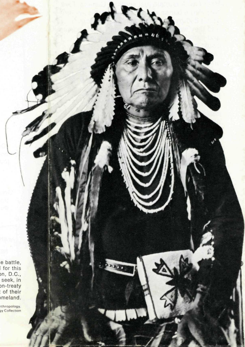
Some 26 years after the battle, Chief Joseph posed for this photograph in Washington, D.C., where he had journeyed to seek, in vain, the return of the non-treaty Nez Perce to a part of their homeland.

The background illustration is part of a Nez Perce buffalo robe decorated with a beadwork strip. It is from an enlargement of a photograph from the Museum of the American Indian, Heye Foundation, New York.