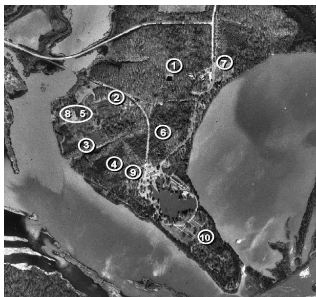
Figure 1. Location of numbered collecting sites at Arkansas Post National Memorial.

water oak ( Quercus nigra ), willow oak ( Q. phellos ), and cherrybark oak ( Q. pagoda ). Mixed oak stands additionally have winged elm and sweetgum. Sweetgum and mixed sweetgum stands are dominated by sweetgum, but also include some oaks. There were 3 small unique stands: eastern red cedar ( Juniperus virginiana ), loblolly pine ( Pinus taeda ), and black locust. The lone tall grass stand is dominated by Bahia grass ( Paspalum notatum ), blackberry ( Rubus sp. ), and goldenrod ( Solidago spp. ). All mowed areas are dominated by bermuda grass ( Cynodon dactylon ), and the mowed areas with trees have scattered post oak ( Q. stellata ) and pecan ( Carya illinoensis ). Details of the overstory, midstory, and understory vegetation on these sites can be obtained from General (2007).