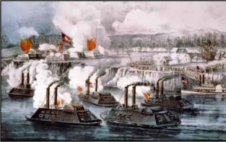
Figure 4: Currier & Ives print of the bombardment and capture of Fort Hindman, Arkansas Post, on January 11, 1863.