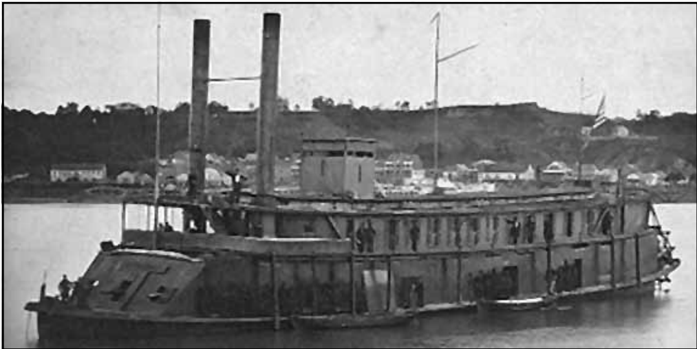
Figure 5: The USS Rattler , the flagship of the Mississippi Squadron,

The regiment was arranged into six companies of about 1,000 men from Cherokee, Smith, and Red River. On April 24, 1862, the regiment was dismounted and sent to Arkansas where it was assigned to First Brigade, Second Division, Trans-Mississippi Department.