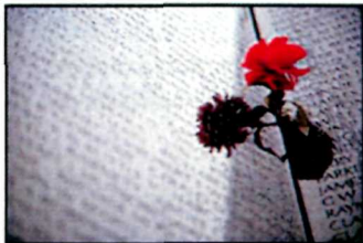
Vietnam Veterans Memorial

Lincoln City, IN http://www.nps.gov/libo/ Abraham Lincoln lived on this southern Indiana farm from ages 7- 21 (1816- 30). His mother, Nancy Hanks Lincoln, is buried there.