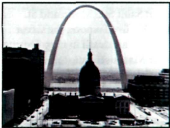
Jefferson National Expansion Memorial

St. Louis, MO http://www.nps.gov/jeff/ Located on St. Louis' Mississippi riverfront, park memorializes Jefferson and others who directed territorial advancement as symbolized in the gateway arch.