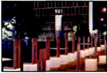
Oklahoma City National Memorial