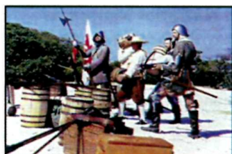
De Soto National Memorial