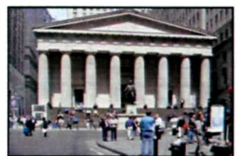
Federal Hall National Memorial