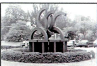
David Berger National Memorial