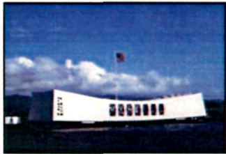
USS Arizona Memorial

South Fork, PA http://www.nps.gov/jofl/ 2,209 people died in the Johnstown Flood of 1889 and Clara Barton successfully led the Red Cross in its first disaster relief effort.