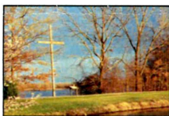
Arkansas Post National Memorial