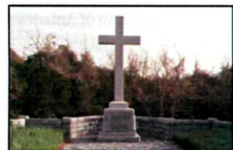
Cape Henry Memorial

Washington, DC http://www.nps.gov/fdrm/ A monument for the 32nd US president features a landscape of four outdoor rooms with granite walls, statuary, inscriptions, waterfalls and thousands of plants, shrubs and trees along the famous cherry tree walk on the Tidal Basin in West Potomac Park.